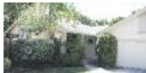
953 Bridgecrossing Way, Concord, represented Seller