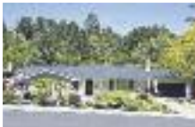
10 Laird Drive, Moraga, represented Buyer