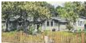
740 Glenside Circle, Lafayette, represented Seller