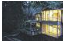
1702 Toyon Rd, Lafayette, represented

EXCELLENT TIME to take advantage of strong demand to get the highest possible price on your home and buy something else while interest rates are still low. They started to go up. If I had a Buyer for your home would you sell it?