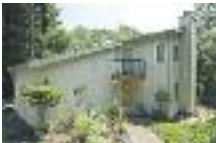
52 Miner Road, Orinda, represented Buyer