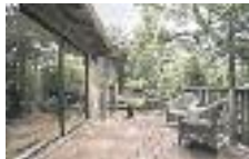
42 Knox Dr, Lafayette, represented Buyer