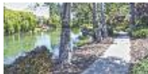
127 Jervis Bay, Alameda, represented Seller and Buyer