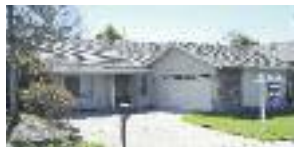
1354 Meadow Glen Way, Concord, represented Seller