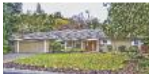
4060 Fiora Place, Lafayette, represented Seller