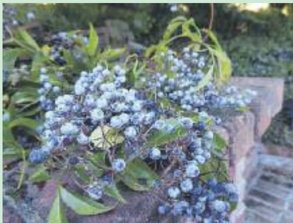
Elderberries are ripe and ready for jams, jellies, and wine making.