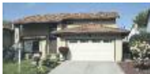
1234 Morning Glory, Concord, represented Seller