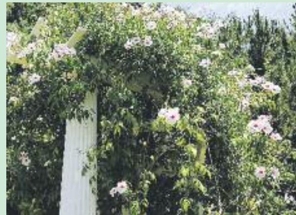
The climbing pink bower vine has made a full recovery after the winter freeze.

ADVANCE TREE SERVICE Lic.: #611120 & Landscaping