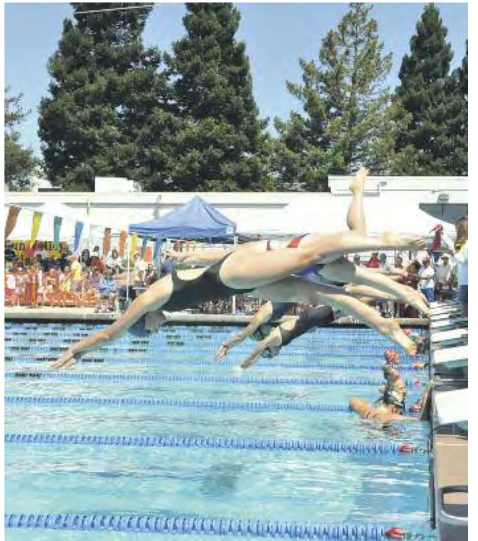
Swimmers prepare for the Lafayette Swim Conference and Orinda Moraga Pool Association All-Conference meets the first two weekends in August.