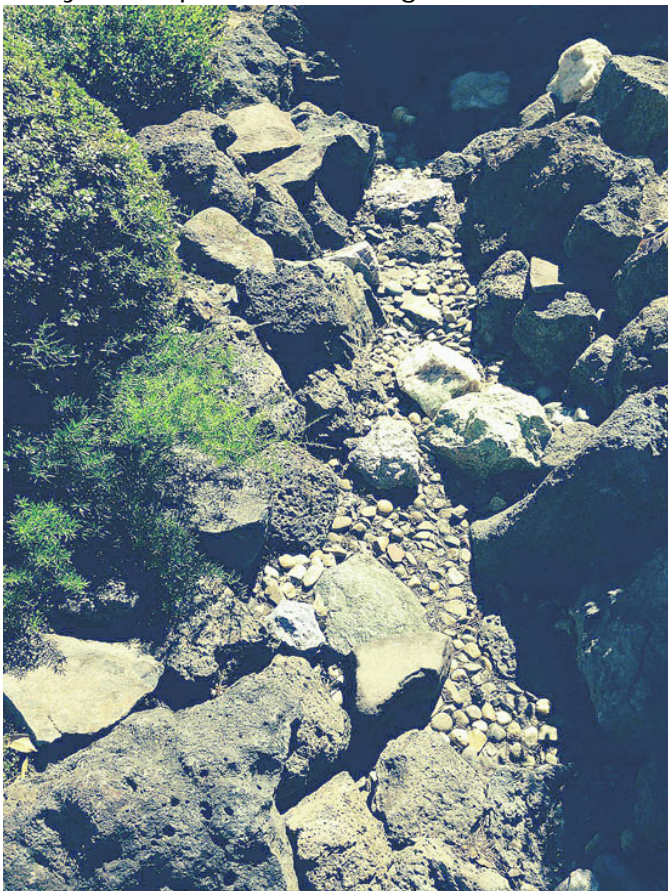
Lava rocks anchor this arroyo seco while river rocks, pebbles, and quartz add interest.