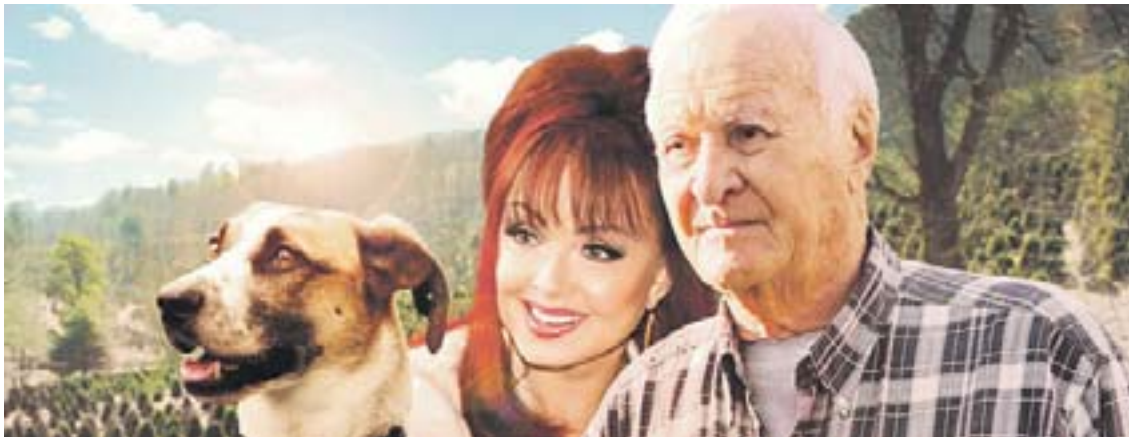
Opening night film, "An Evergreen Christmas"