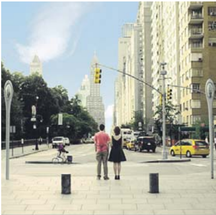
Closing night film, "Putzel"

There is a wide selection of films to choose from at all three venues. Be sure to read through the program, or visit www.CAIFF.org for film schedule and synopses.