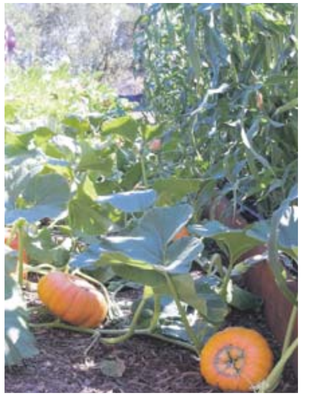
Thump a pumpkin and scrape your fingernail over the shell. If it doesn't pierce, cut the stem to harvest.

vorite vegetable or fruit at its peak. Berries are plump, juicy, and deep in color. Apples fall into your hand the second they are touched. Our noses lead us to the sweet smell of a ripe pear, our eyes shine on that perfect deep red tomato, and our ears hear the hollow thump of a crunchy melon. We use all of our senses to identify the best time to harvest including our common sense. If possible, pick your produce early in the morning, just as the sun is rising. The air is cooler and the crops are crisp, allowing them to last longer. If you wait to pick until the heat of the day, lettuces, radishes, peas, chards, and leafy greens will be limp and wilted. The second best time to harvest your non-droopy crops like zucchini, grapes, tomatoes, and root vegetables is early evening, preferably after the sun has set. The early sunbathing actually adds to their sugariness.