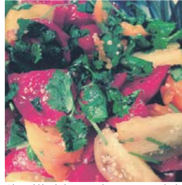
A beautiful bowl of sun-ripened tomatoes in several colors tossed with cilantro makes a delicious autumn salad.

rural America, how do we know when the time is ripe to harvest our produce? Nature usually has a way of informing us about the optimum time to pluck your fa-