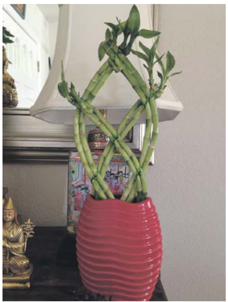
Bamboo is placed on a desk to invite luck into studies and work at this Orinda home.

The Self-Knowledge and Self-Cultivation area of the Feng Shui Bagua map (see diagram, page D12) that correlates with skills, knowledge and studying is located from the front door in the near left area of a home – a very auspicious placement. But don't despair if your office is located in another area. Certain design principles can be used to make a room located elsewhere in the home reflective of good feng shui.