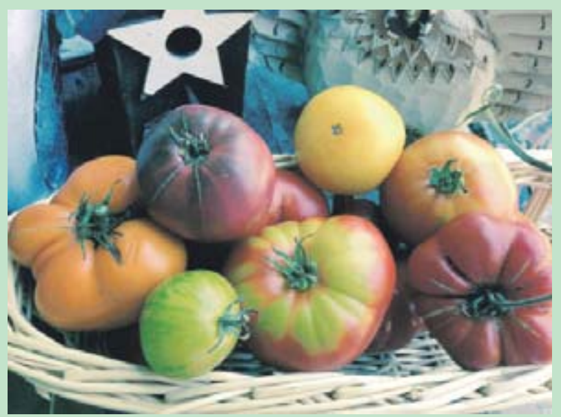
A basket of fresh picked tomatoes.

Follow us on Twitter (advancetree) and like us on Face Book (ADVANCETREESERVICEANDLANDSCAPINGINC.)