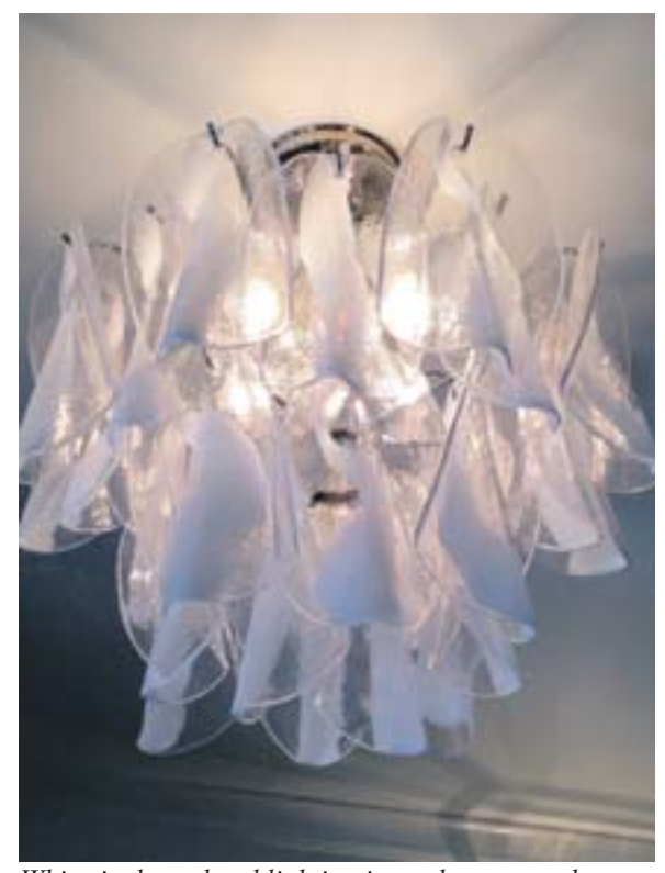
Whimsical overhead lighting is used to create the proper ambiance in this Lafayette home.