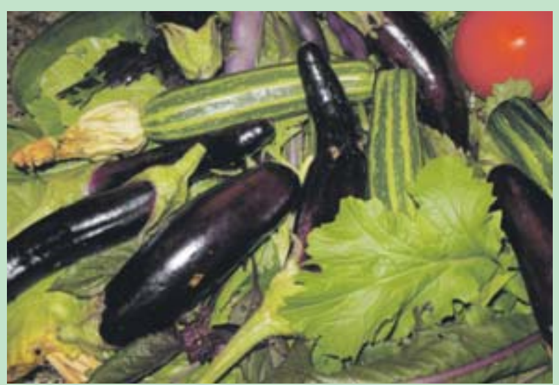
Eggplant, zucchini, beans, lettuces, and tomatoes are ready for the table.

Kale : As long as you leave six to eight leaves of the kale on the stem, you can start picking kale as soon as it is established. Kale grows quickly and will continue to send out more leaves.