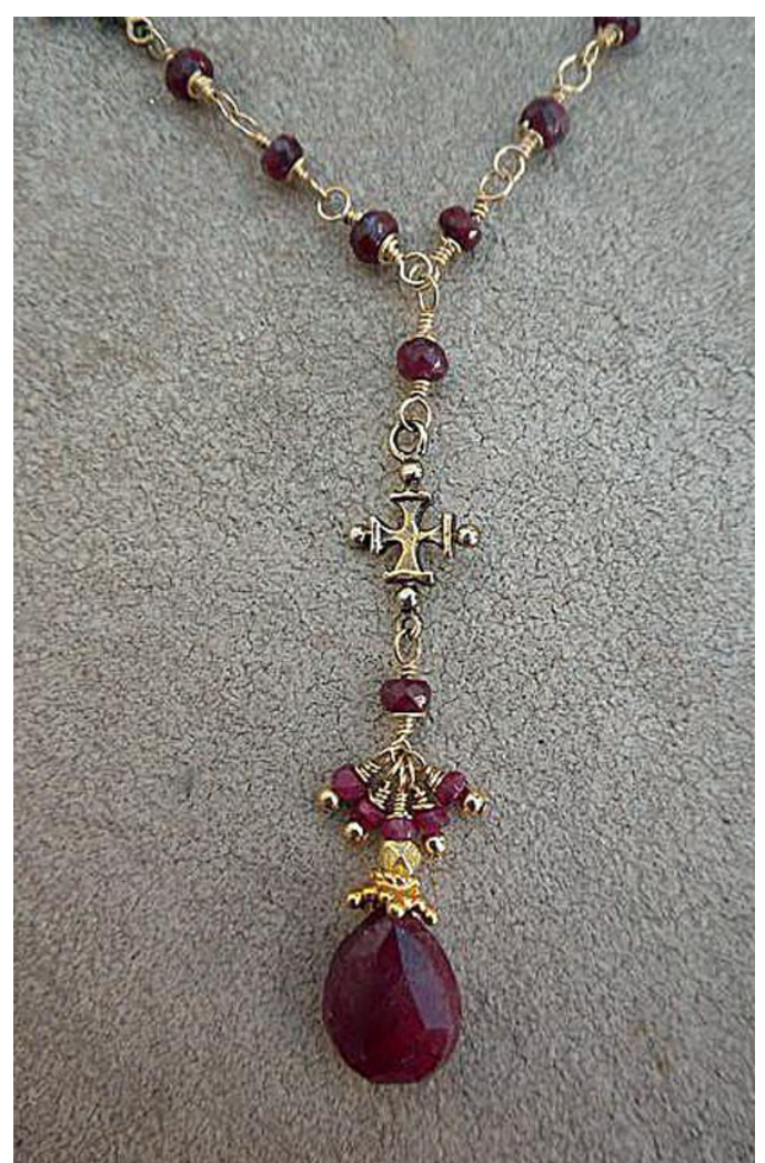
Ruby Drop Necklace from Divinity Jewelry.