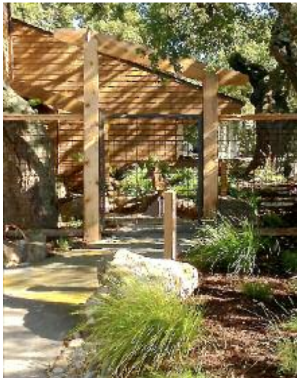
The inconspicuous fencing almost disappears visually but still keeps the deer at bay.