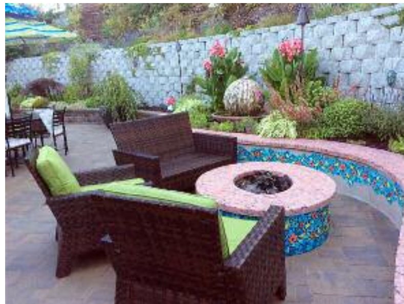
First Place winner, Small Residential Design/Build Installation: Turquoise mosaics and lime green umbrella and pillows enliven the horizontal surfaces in Darlene Davidge's yard. Although it appears to be marble, it is actually concrete.

The Davidge family, which includes grown children, finds the garden area a peaceful sanctuary. The splash of the fountain, the sights and sounds of the finches and humming birds, the smell of flowers and the sizzle of dinner on the grill makes their new yard a place they don't ever want to leave. “It's almost