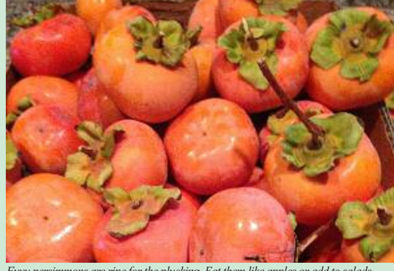
Fuyu persimmons are ripe for the plucking. Eat them like apples or add to salads.