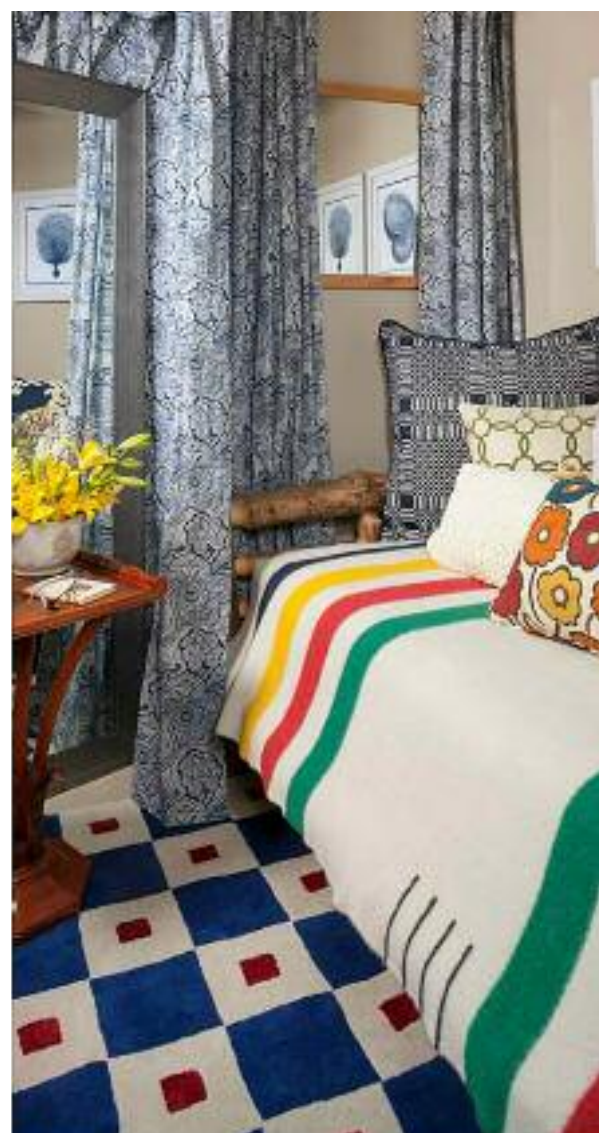
Guest bedroom in a cabin. Hudson Bay slippers that match the room make guests feel like no detail is overlooked.

The turkey is ordered, the farmers' market run is on the calendar and you are getting your home ready to host family and friends for the Thanksgiving holiday. We chatted last month about setting the table and creating an inviting atmosphere but what about the rooms where your guests will stay? In my home, we have several rooms that are multi-purpose but we don't have a dedicated guest room. Each time we have overnight guests, there is some kind of transition that has to take place in addition to the deeper cleaning required with a house full of boys and pets.