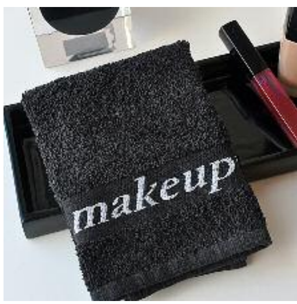
When outfitting a cabin or second home, order slippers, embroidered robes and towels – black makeup towels are great. For a lovely guest experience at home, even and especially if you are using a sofa bed or child's room converted for the night, consider investing in a few designer robes with a simple monogram or "guest."