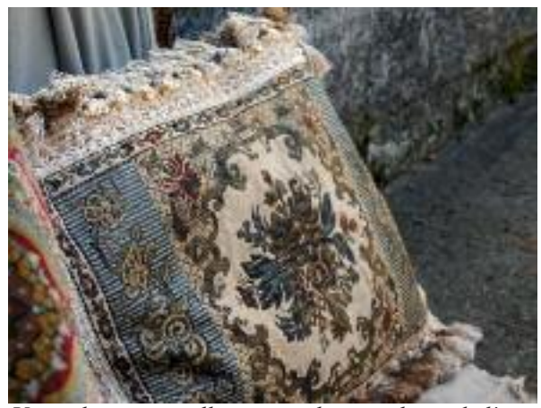
Using decorative pillows can take an ordinary kid's bedroom and bump it up for guests. Featured is a Couture Chateau pillow, lined and interlined made from an antique textile.