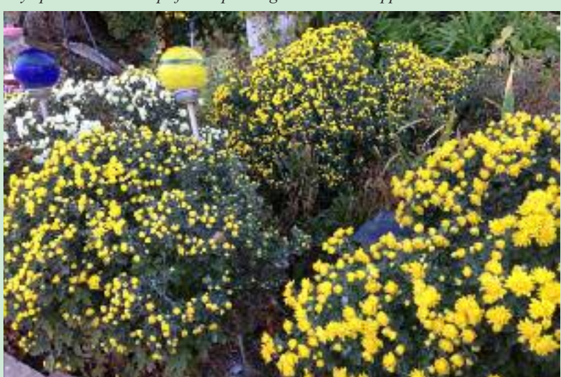
Gazing balls illuminate a fall chrysanthemum garden.