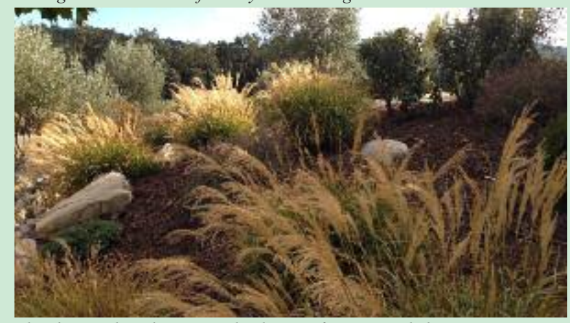
The ultimate drought resistant landscape of grasses and olive trees.