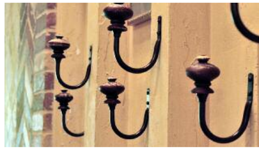
Use hooks inside double duty rooms for easy care items like robes, towels and even welcome notes for guests.

3. Use designated baskets for specific vignettes and include every item for easy set up. For those with smaller homes or no guest bedroom, this is one of my top tips. We create a designated basket and essentially create our own version of "room in a basket" with: sheets, bed coverlet, mattress cover, nice towels, embroidered robe, slippers, beautiful pillows both for sleeping and decoration, soaps, shampoos, sewing kit and other sundries.