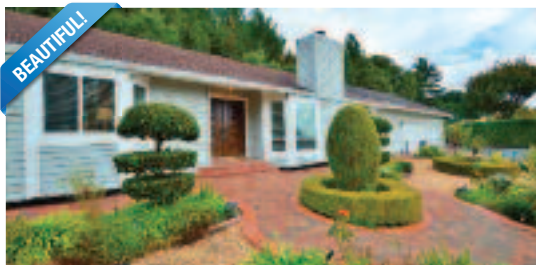
DUDUM REAL ESTATE GROUP