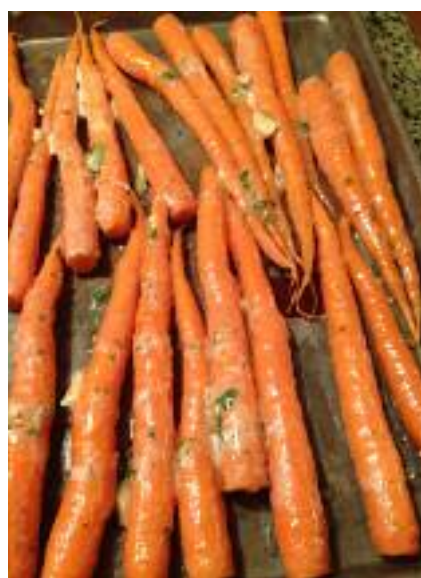
Fresh picked carrots sprinkled with basil are ready to roast.