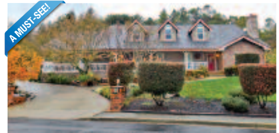
DUDUM REAL ESTATE GROUP