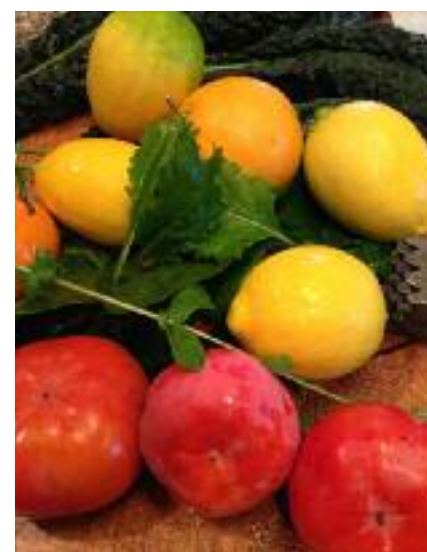
The final crop of persimmons sits on the chopping block with fresh greens and Meyer lemons.