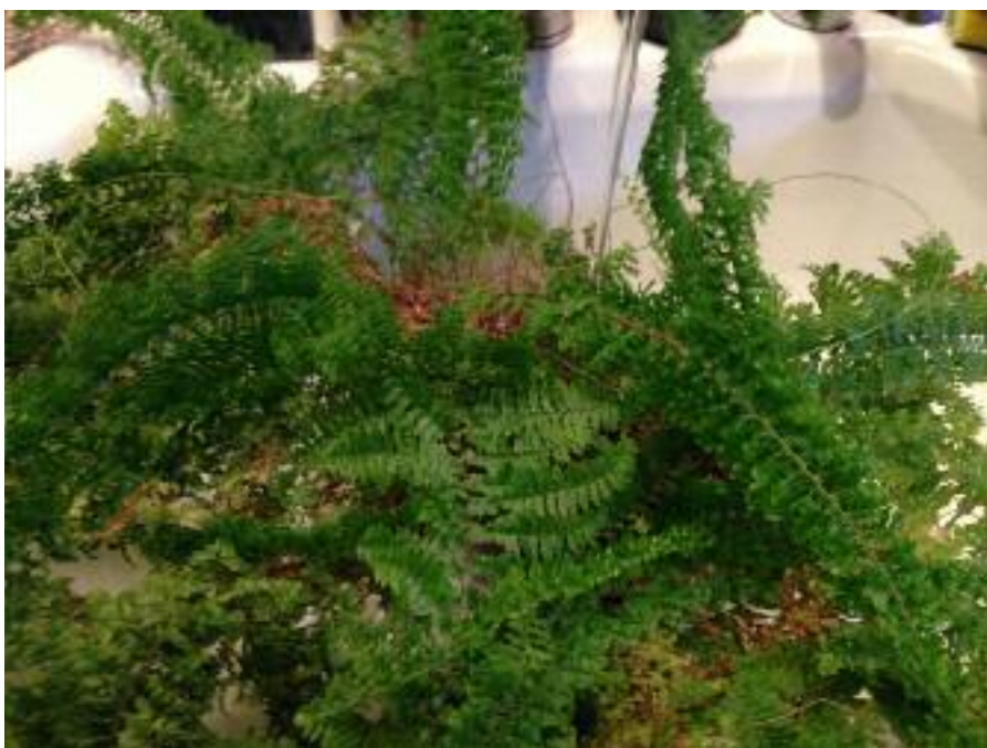
A fern gets a shower and shake in the sink.

Since I grew up on a 360-acre farm where we grew a great variety of organic fruits, vegetables, and herbs as well as a couple of acres of flowers, my fondest memories all have something to do with being in the dirt. I'll never forget the winter when my mom caught me picking her prized camellias. As she shouted and scolded, my devoted dog jumped between us growling at her. I learned the lesson that it was not okay to pluck flowers in any garden without permission, even if the bouquet I was picking was for my mother. She learned that our dog protected the kids first, even from our parents. Raising my own children, I wanted to give them opportunities