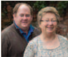
THE CHURCHILL TEAM