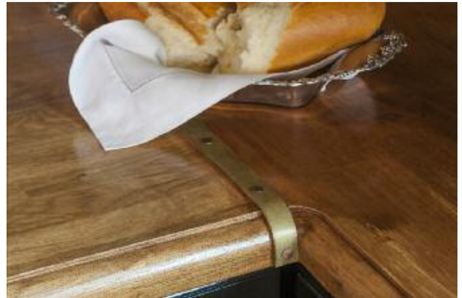
Do your countertops need refinishing? I have brass straps on butcher block and call in marine-grade finishers to keep them in ship shape.

Third: Take Photos, Look Objectively, Document Progress for Encouragement. We tell our clients to take photos of each room in their home this time of year. Why? Because you'll see the space more clearly once you take a solid photo of a space, let it alone for a few days, clear your head, and by extension, your visual palate and come back to the photos a day or two later.