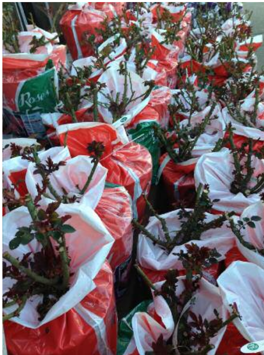
Bare-root roses are now available in nurseries and garden centers.

that would trigger remembrances, whether it was harvesting the first beans, or burying a beloved pet. I still think about collecting blackberries for summer breakfasts at my grandparents' horse barn, learning to drive the jalopy in the orchard, and saving hollyhock seeds at Nonie's. A lifetime of fond memories grows in the garden.