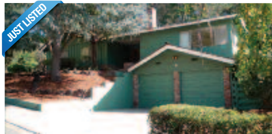
JON WOOD & HOLLY SIBLEY