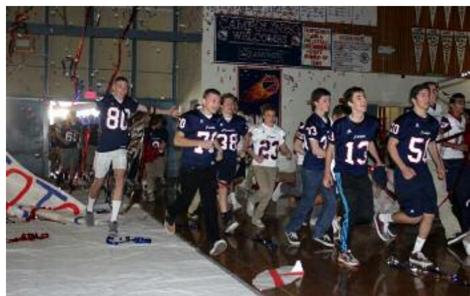
The team runs into meet a proud crowd.

the program's history. The team was greeted by cheering fans from throughout the community. The celebration included food, special gear, and a showing of the championship game.