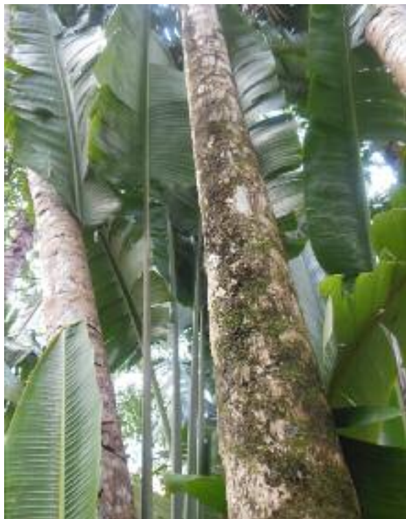
A traveler's tree looks like a banana tree but is really a bird of paradise