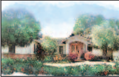
Beautiful Lafayette Remodel