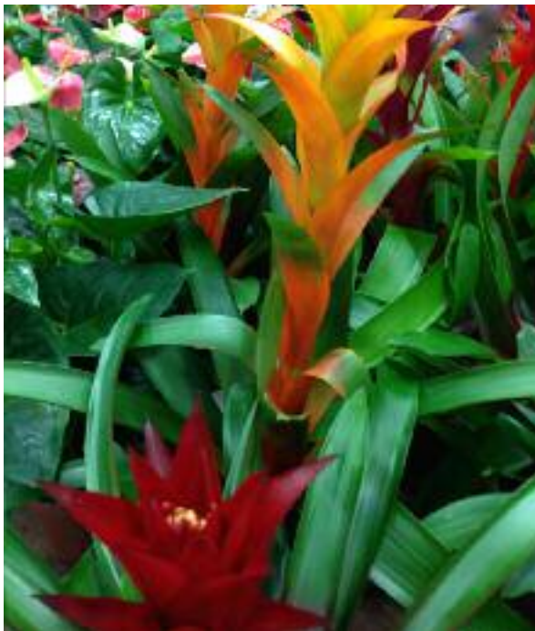
Pineapples are bromeliads. Bromeliads are easy and beautiful.

What is not to love about these perennial monocotyledons? In tropical settings, we see them attached to trees, structures, or growing like pineapples. In California, they are usually used as houseplants requiring minimal maintenance. They thrive outdoors in the heat as long as the weather remains above freezing. Their brilliant bracts maintain color for six months or more and each rosette blooms only once. As the mother is dying, pups are born, repeating the cycle. Fill the cup