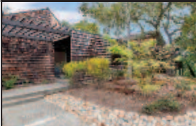
238 The Knoll, Orinda