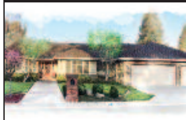
The Best of Lafayette