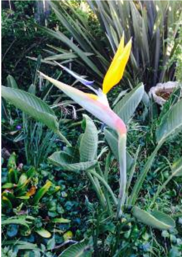
Plant a few bird of paradise to enjoy the feeling of the tropics.

"God has given us a world that nothing but our own folly keeps from being a paradise." – George Bernard Shaw