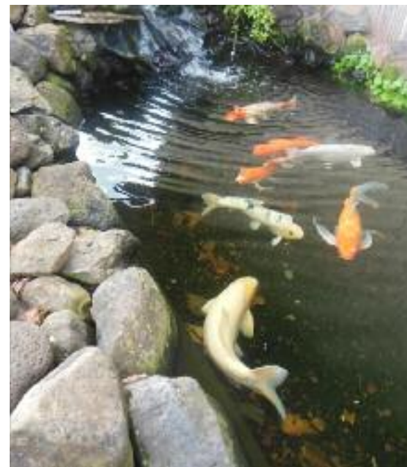
For water enjoyment, entertain a koi pond.

Experience the luxury of getting up close and personal with friendly, curious, colorful fish by installing a koi pond, probably the most popular of all garden installations. With proper filtering, aerating and feeding, you will enjoy years of exotic water entertainment.