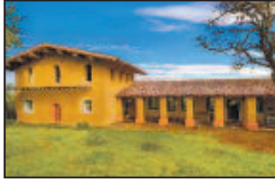
843 Las Trampas Road, Lafayette