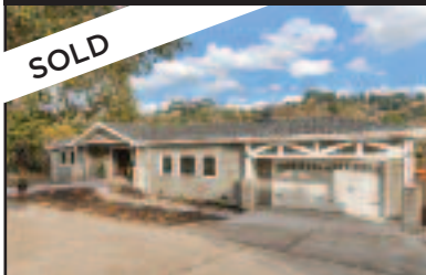
1106 Upper Happy Valley Road, Lafayette