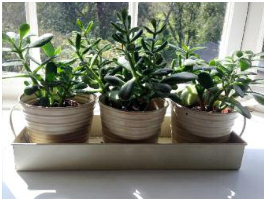
Green, the color of spring