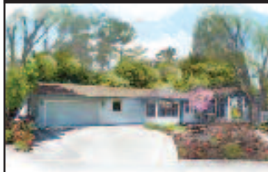
Burton Valley Contemporary