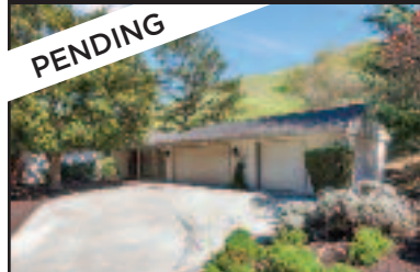
3166 Lucas Drive, Lafayette