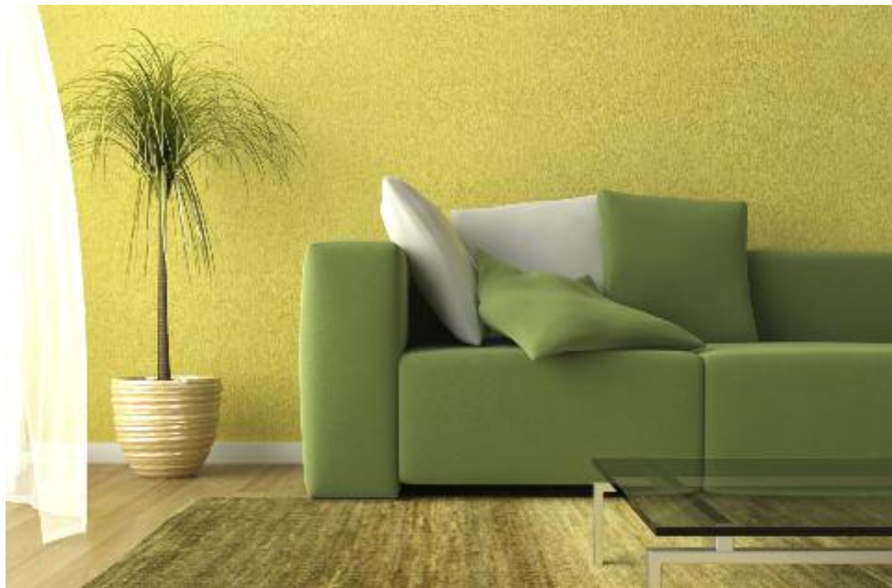
The fresh green of spring is nicely expressed in this living room.

The Wood element and the fresh green color resembling jade governs spring in feng shui, and spring has sprung! Spring symbolizes colorful new growth, new projects, new friendships, new bonds, new beginnings and abundant health – especially when associated with the idea of family. You can think of your family as the roots of your being, your DNA, your very own new beginnings. Families are defined by the group that loves you unconditionally and may include your immediate family but also close friends or colleagues.