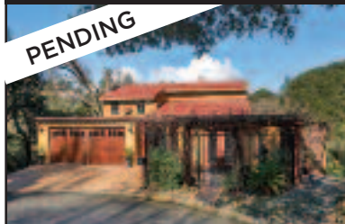
6 Arbolado Court, Orinda