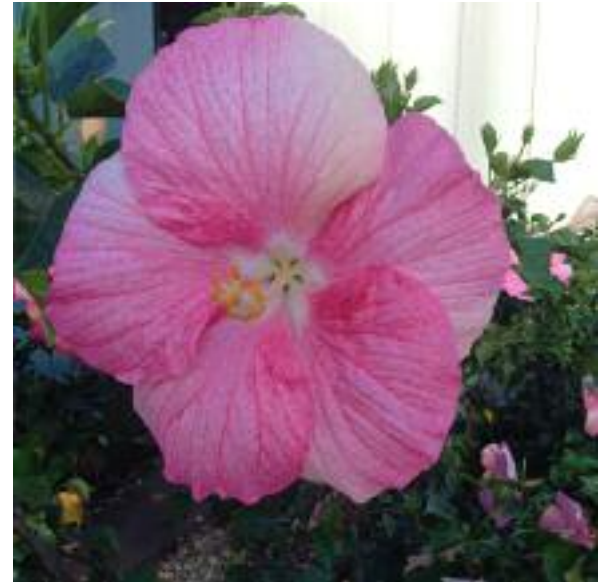
Tuck a pink hibiscus in your hair.

When you are looking for high impact tropical flair with low maintenance, you can't beat the show-stopping hibiscus. Easy to grow and available in a kaleidoscope of colors, hibiscus enjoys temperatures up to the 90s but doesn't do so well under 30 degrees. Hibiscus can be trimmed into gorgeous hedges or used as a moveable container plant.