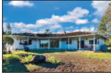
761 Tofflemire Drive, Lafayette