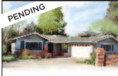
839 Ava Court, Lafayette