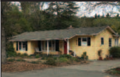
Upper Happy Valley