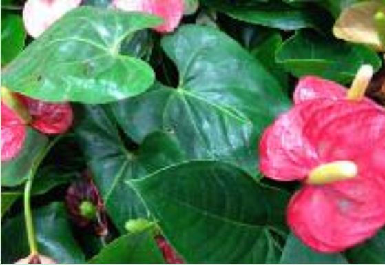
Anthuriums are available in multiple colors.

CHECK out the new science based app, Tomato MD, which helps gardeners identify more than 35 diseases, insects or disorders of tomatoes. The demo version is free; the full version is $2.99 from Apple App store or Google Play.