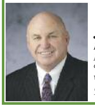
Jim Colhoun Relocation & Home Marketing Specialist CalBRE# 01029160 www.JimColhoun.com 925,200,2795

Residents of Orinda's desirable Glorietta neighborhood are readily familiar with one of the most distinctive properties in the area. Now for the first time ever, 102 Meadow View Road comes to the market March 27, 2015. Built in 1990 on a level .40 acre lot, this East Coast traditional style home has been recently refreshed and re-energized. This is a home where lifetime memories are created and where outdoor weddings and memorable parties will be treasured. Rarely is a home with this magical combination of space and structure available. Open Saturday and Sunday March 28 and 29 from 10:00 am to 4:00 pm. Property is listed at $1,995,000. Contact Jim Colhoun at 925.200.2795 for more information or to arrange a private showing.