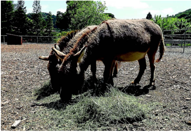
Sister donkeys, Janie (partly visible) and Libby, munch on their daily flake of hay.