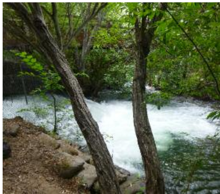
EBMUD replenishing the Upper San Leandro Reservoir, after purchasing water that comes from the Sacramento River.