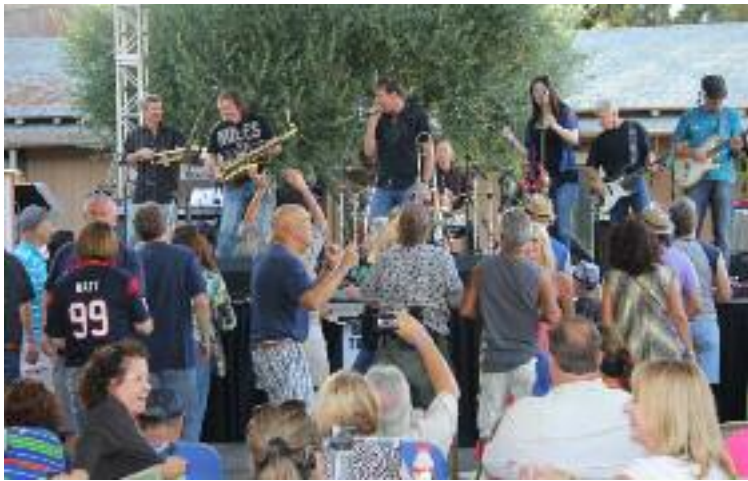
Both days will feature free live music on four stages.

The simulator is 20 feet long, weighs approximately 6,500 pounds and features a sophisticated hydraulics system, specifically engineered to simulate varying degrees of earthquake intensity. It has been outfitted with furnishings to replicate a