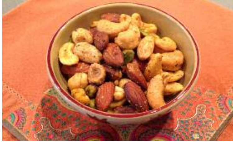
Cajun-spiced mixed nuts