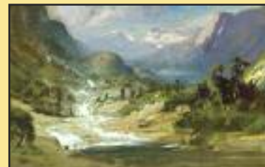
William Keith

In 1907, William Keith accompanied John Muir to Yosemite's twin valley, Hetch Hetchy. The trip was not a lighthearted hike, but a determined mission to bring the rich colors and epic landscapes back to the Bay Area, where politicians schemed to dam the valley. On display are Keith oil paintings, accompanied by photographs and documents courtesy of the Sierra Club, Restore Hetch Hetchy, and the San Francisco Public Utilities Commission.