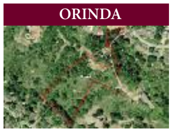
46 Cedar Terrace Excellent 3.93 acre property located at the end of Cedar Terrace, off of Cedar Lane. Views and Privacy!