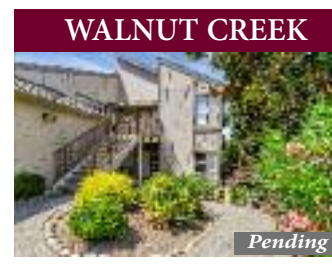
3311 Rossmoor Pkwy #4 A rarity! Fantastic, level in (no steps) Cascade model on golf course w/views of hills & course from most living spaces. Granite kitchen w/breakfast nook, plantation shutters, view deck.

1501 Canyonwood Court #2 Fabulous Sonoma Wrap w/2bd/2ba + washer/dryer in unit. Cultured marble countertops in kitchen/baths. Elec. chair lift at stairs. Rear veranda enclosed, side veranda open. Views. $365,000