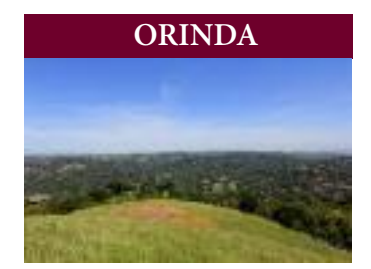
40 Dos Osos Incredible Orinda, San Pablo Dam, Mt. Diablo views + abundance of nature surrounds this supersized parcel bordering EBMUD land. Once in a lifetime opportunity raw land sale.