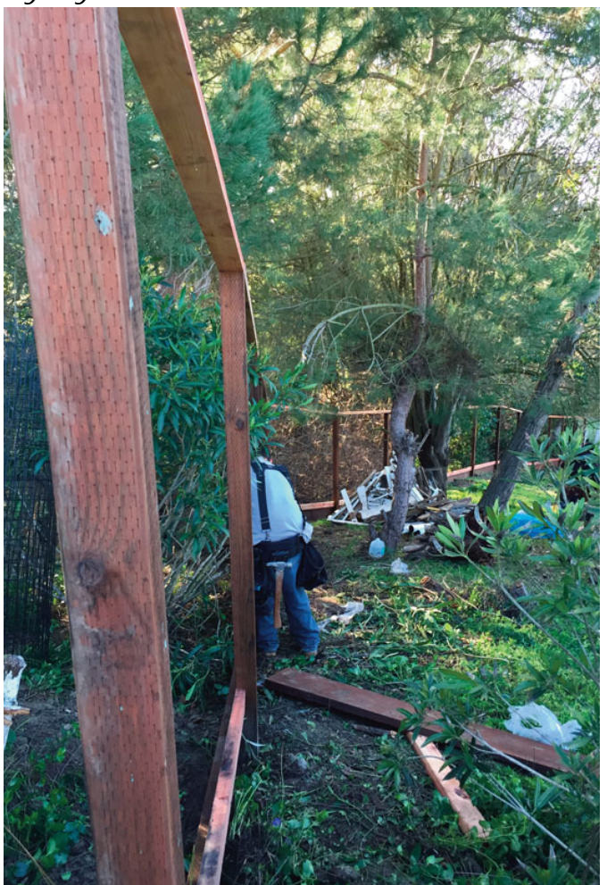
A crew builds a fence.