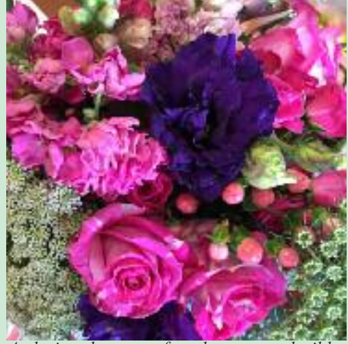
A glorious bouquet of stock, roses, and wild Queen Anne's Lace.