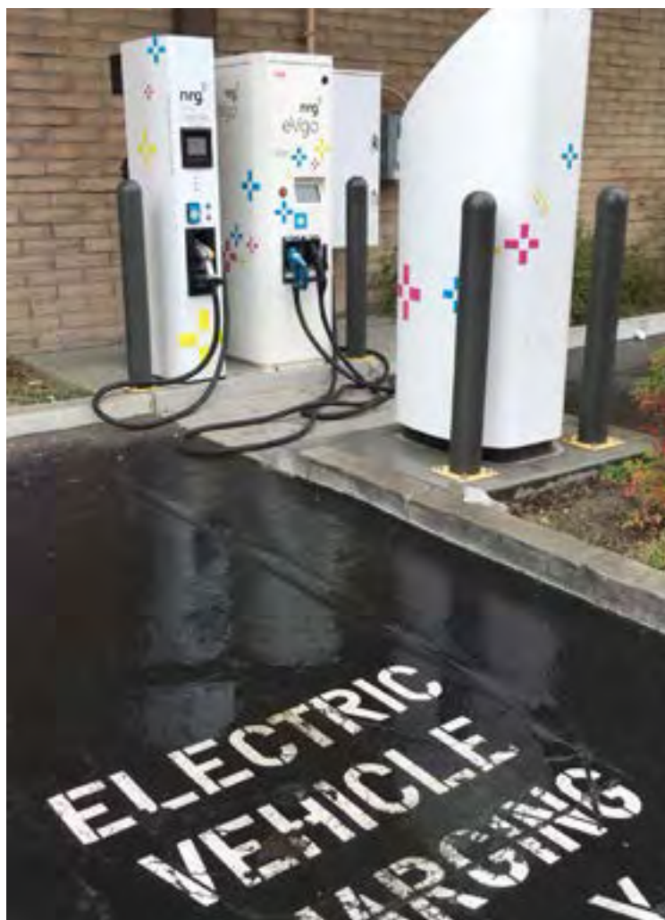
The charging stations will be like these at Whole Foods.

Electric vehicle drivers in Lafayette will soon be able to plug in and charge their cars on Golden Gate Way, between the Lafayette Library and Learning Center and the Park Theater, at no cost to the city.