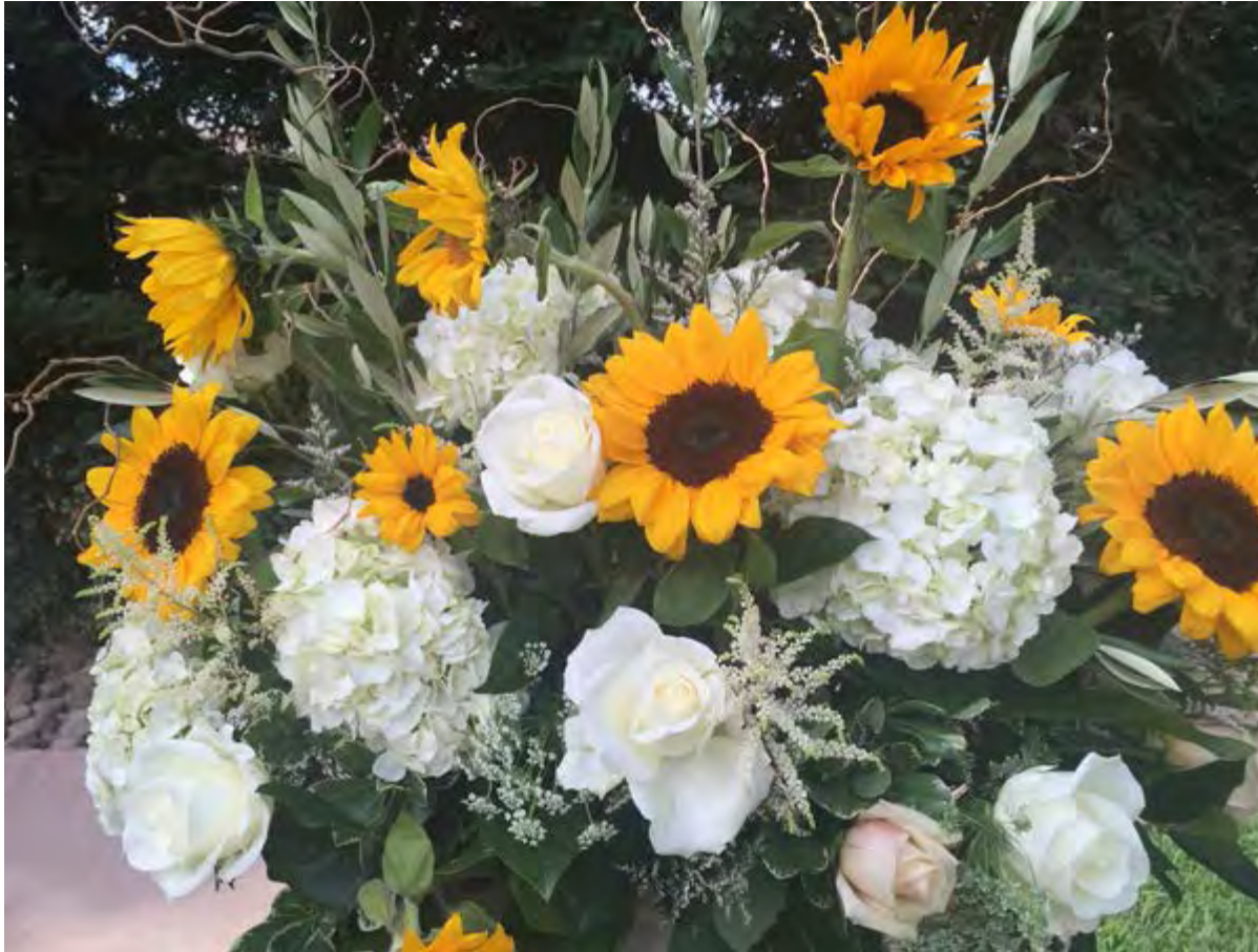
Who can resist a summery arrangement of sunflowers and hydrangeas?

"There shall be eternal summer in the grateful heart." — Celia Thaxter