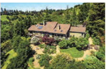
ORINDA $2,368,000 5/4.5 Spectacular Gated Estate. Peaceful Setting. Views! Close to Town/BART. Top Schools. Rick & Nancy Booth CalBRE #01388020