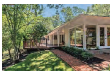
ORINDA $1,199,000 5/2 Fabulous Updated Glorietta Home on .65 Acres Close to Schools, BART & Town Finola Fellner CalBRE #01428834