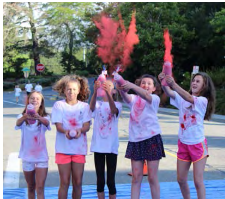
Patriotic red paint was sprayed on the participants of Haley's Run, held July 4.

Clouds of vivid red and blue colors drenched the happy participants of the 12th annual Haley's Fourth of July Color Run for a Reason in Orinda.