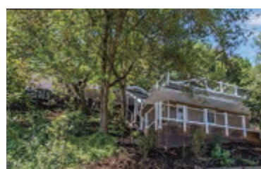
ORINDA $1,425,000 3/2.5 Remodeled charming wood shingled traditional! Plus newly constructed 1000 SF Great room. Laura Abrams CalBRE #01272382