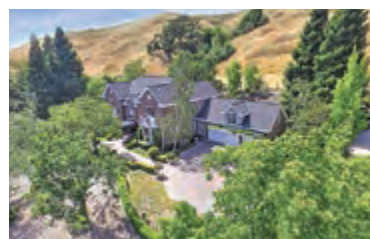
MORAGA $3,295,000 6/5 Exquisite Branaugh home in Sanders Ranch, 6426 sqft, 1+ acre lot, beautiful pool & grounds Elena Hood CalBRE #01221247