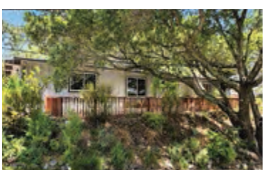
ORINDA $1,085,000 3/2 Beautifully remodeled single story home w/contemporary elements located on upper Claremont Laura Abrams CalBRE #01272382