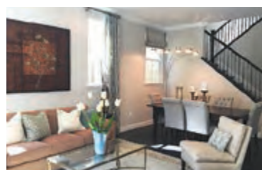
ORINDA $1,599,000 5/3 Beautiful new construction in downtown Orinda. Spectacular appliances/finishes throughout McAtee|Wilson CalBRE #01809247