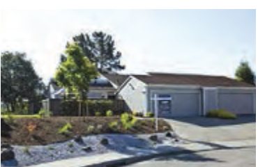
MORAGA/CANYON $679,000 3/2 BEAUTIFUL Ascot Highlands home. Front court yd w/landscape, back yd w/patio & views. The Beaubelle Group CalBRE #00678426

5 Moraga Way | Orinda | 925.253.4600 | 2 Theatre Square, Suite 117 | Orinda | 925.253.6300