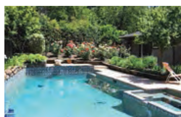
LAFAYETTE $1,550,000 4/3 Very private on over 1/2 acre. Wonderful yard with pebble-tech pool & expansive lawn. Jim Ellis CalBRE #00587326