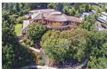
ORINDA $2,995,000 5/4.5 Breathtaking Mediterranean style estate with approx. 4865 square feet of living space. Vlatka Bathgate CalBRE #01390784