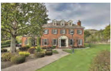
MORAGA $2,595,000 5/4.5 Exciting & prestigious in Sanders Ranch, 4525 sqft, stunning kitchen, lovely garden w/pool! Elena Hood CalBRE #01221247