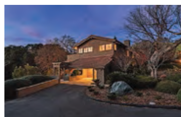
LAFAYETTE $1,935,000 4/3.5 Elegant home w/stunning views! Gated community with club house, pool & tennis courts. Kim McAtee CalBRE #01349169