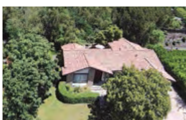
MORAGA/CANYON $1,098,000 4/2 PRIVATE RETREAT in highly desirable Campolindo neighborhood. One lvl home w/open flr plan. Vlatka Bathgate CalBRE #01390784