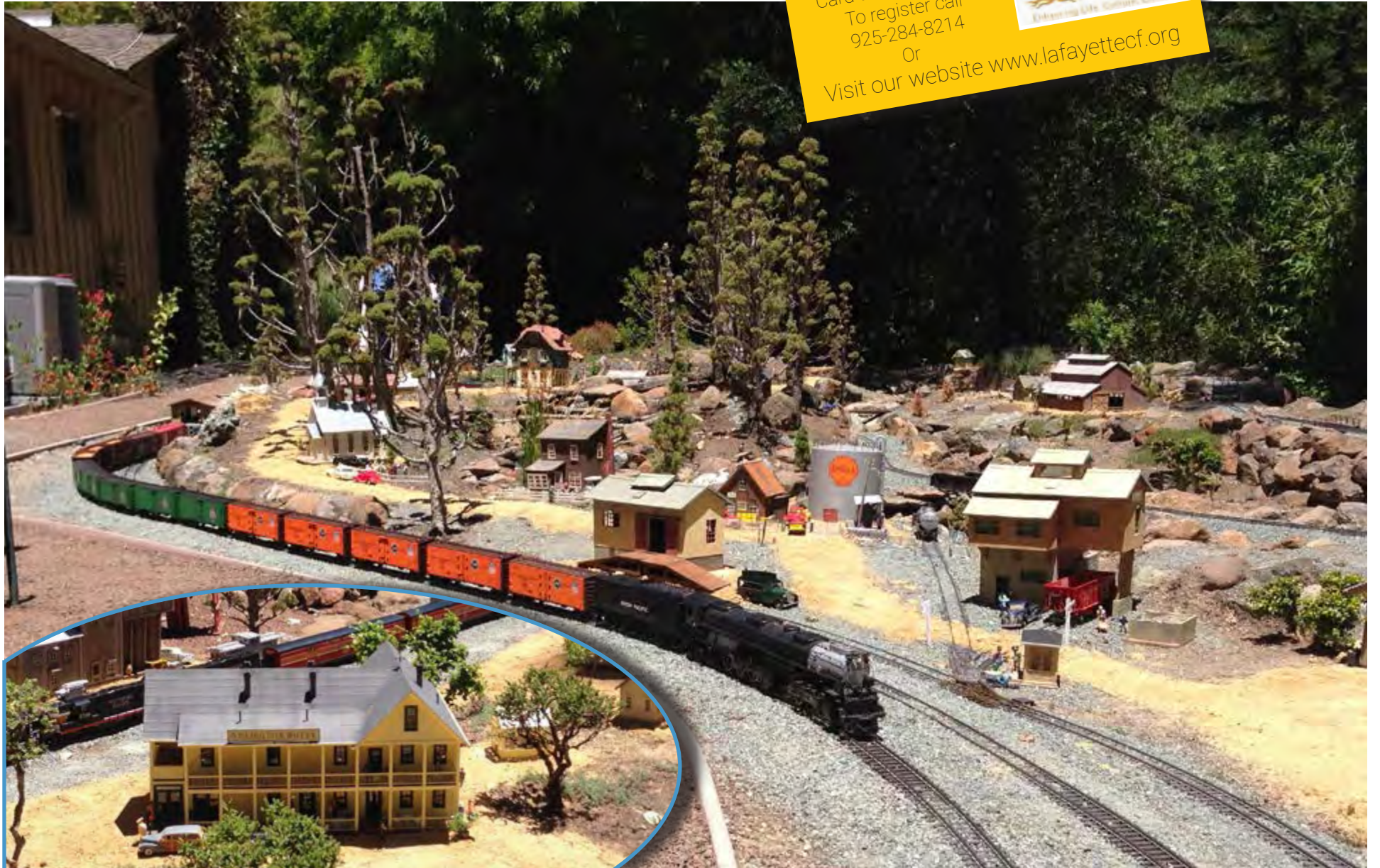
A long freight train hauled by an impressive mallet steam locomotive rounds a bend on the Los Arabis Creek garden railroad.