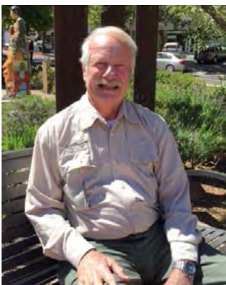
Larry Olson Photo Cathy Dausman living marine resources unit; searching for whales on the move or entangled in fishing gear, and noting the location of crab and salmon vessels.