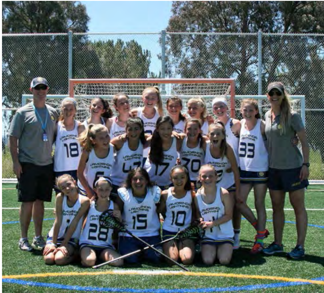
The Flash, the G13A team of the Lamorinda Girls Lacrosse Club, played in the NCJLA championship game.