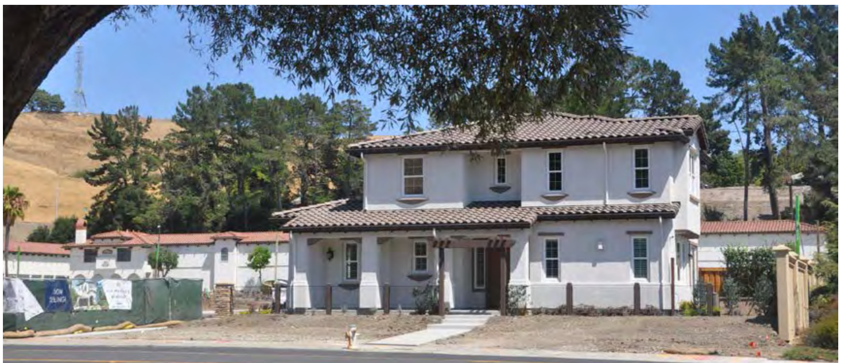
First house in the new development Via Moraga on Moraga Road