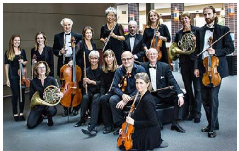
The Pacific Chamber Orchestra.