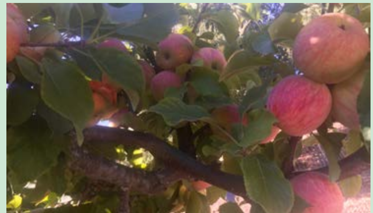
Cynthia Brian's apple trees are filled with disease-fighting benefits.