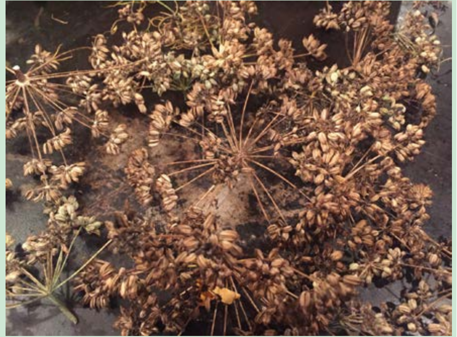
Fennel seeds are being dried on a cookie sheet. The seeds aid in digestion.