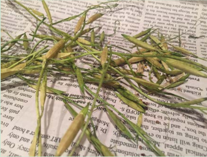
Arugula, also known as rocket lettuce, boasts restorative and revitalizing properties. Dry the seeds on a plate. Plant in any season.