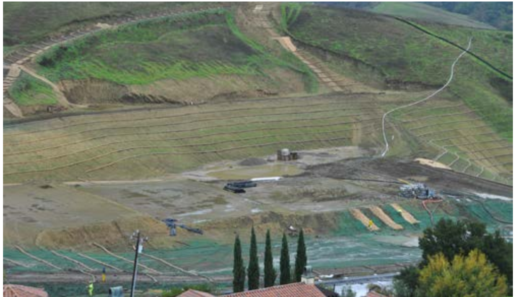
A landslide is slowing work at Bellavista.

"It would have been a burden on the Bellavista Home Owner Association if the landslide had activated after the homes were built and