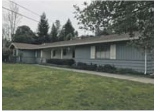
Orinda Represented Buyer