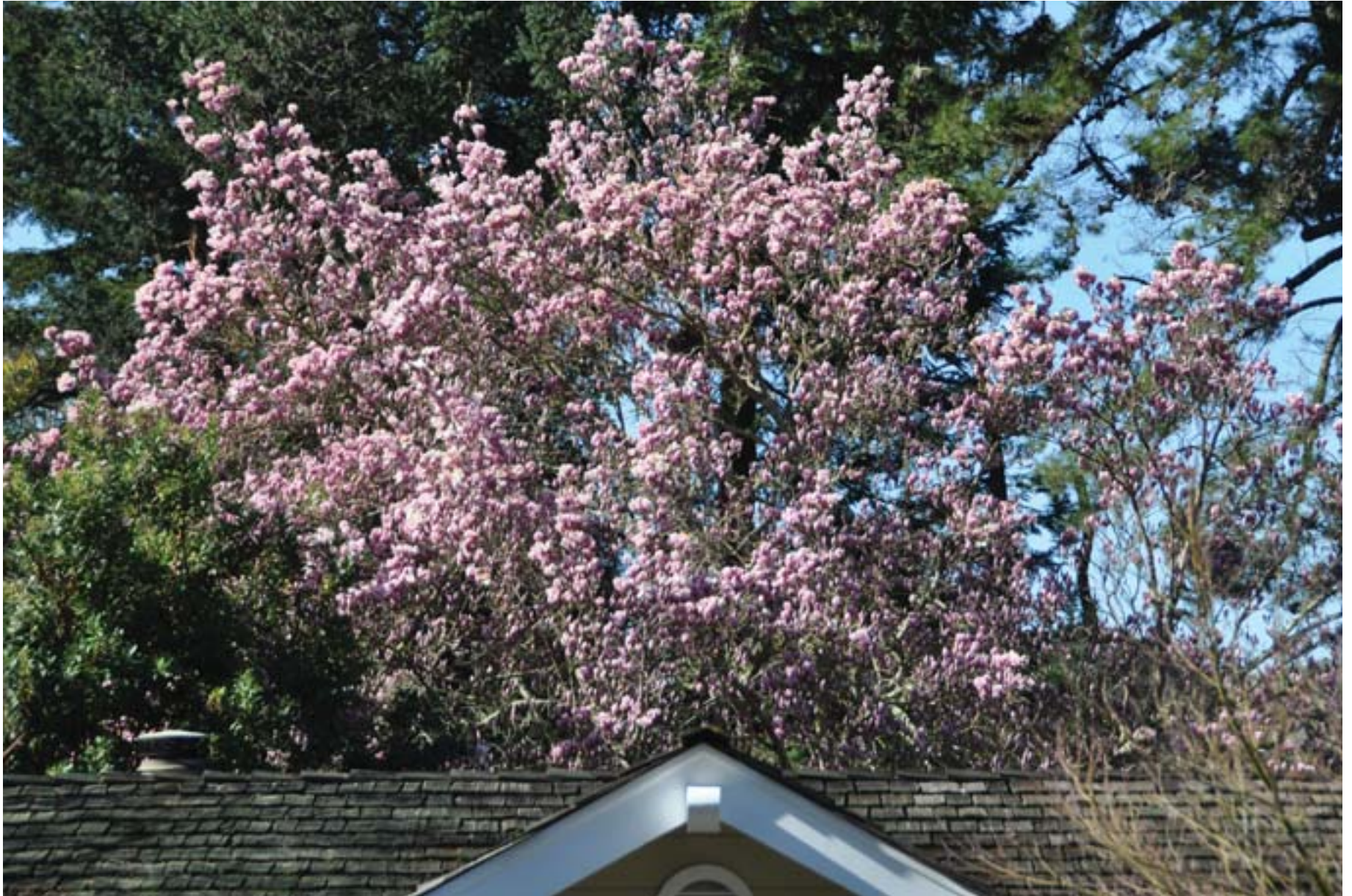
Pat Doughty's magnolia tree