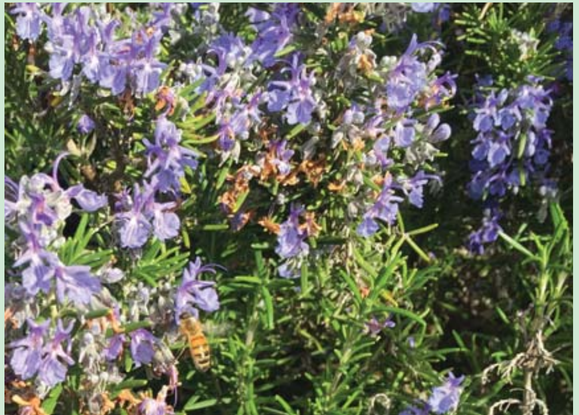
Honeybee on rosemary.