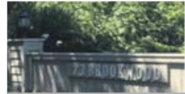
Orinda Represented Buyer