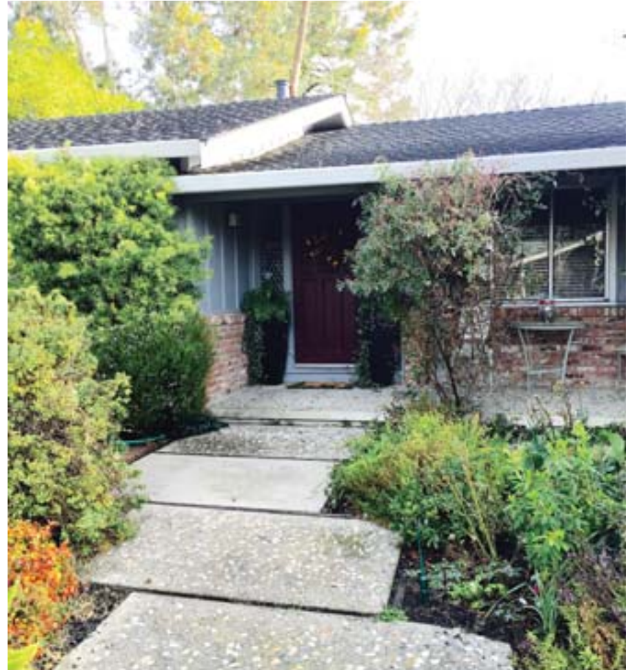
The front entrance is flanked by life force potted plants which mark the entrance at this Lafayette home

Try to tackle a few things on this list each day or each week and be mindful to put a “love my home” intention into your tasks so what’s created is a positive thread you can, from that day forward, weave into the layers of what home means to you. As you create more flow and greater ease be mindful of the profound shifts that abundant healthy energy invites towards your home. As you tidy up just enjoy the process of an intentional orchestration of all that is positive into your home and life and be grateful for all that you have created.