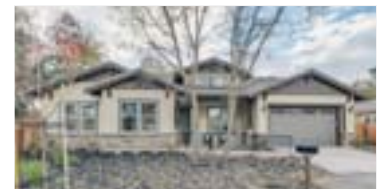
Walnut Creek Represented Seller & Buyer