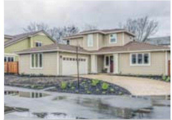
Pleasant Hill Represented Seller