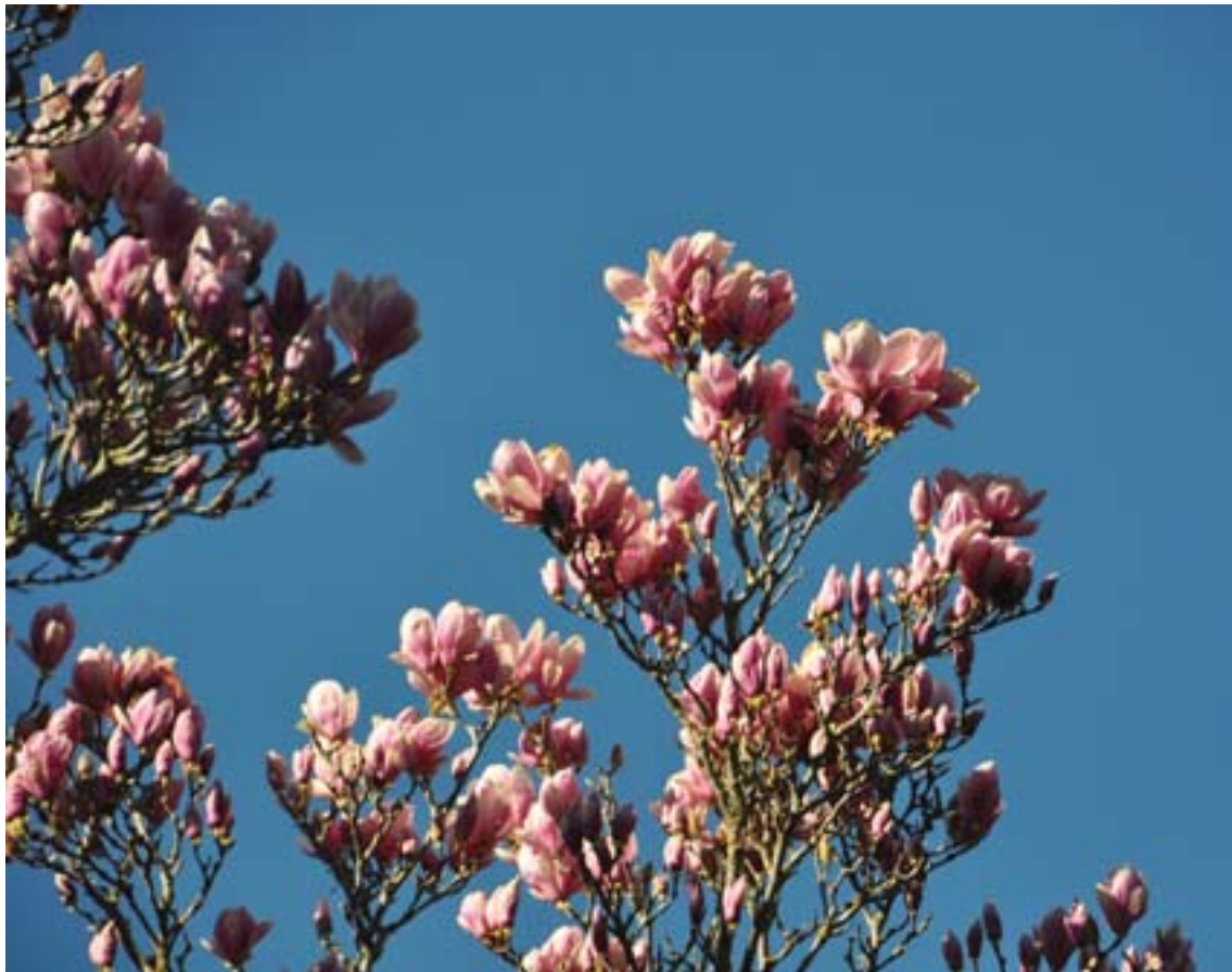
Flowers of a magnificent magnolia tree in a Lafayette back yard