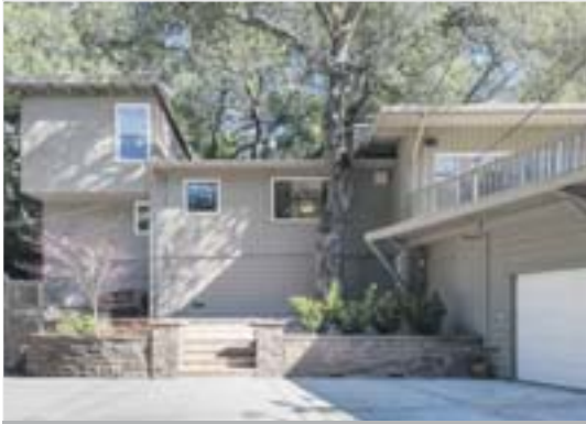
Orinda Represented Buyer