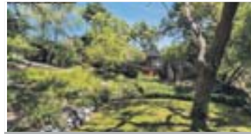
Orinda Represented Buyer