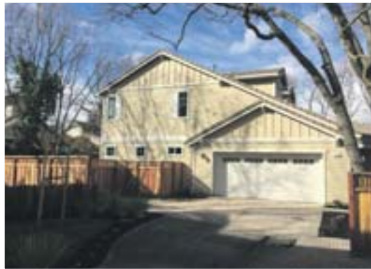
Pleasant Hill Represented Seller