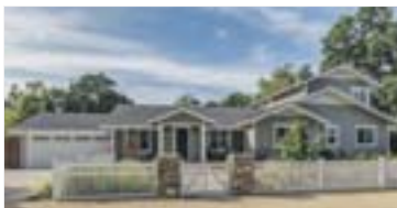
Walnut Creek Represented Buyer