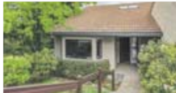
Moraga Represented Buyer