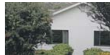
El Sobrante Represented Seller