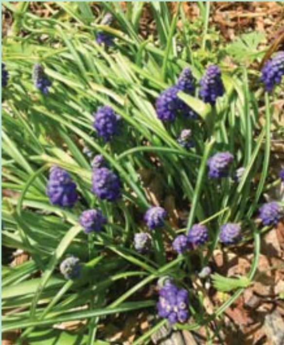
Tiny grape-like muscari fill the garden.