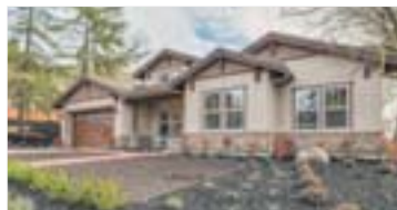
Walnut Creek Represented Seller