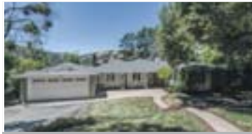
Orinda Represented Seller