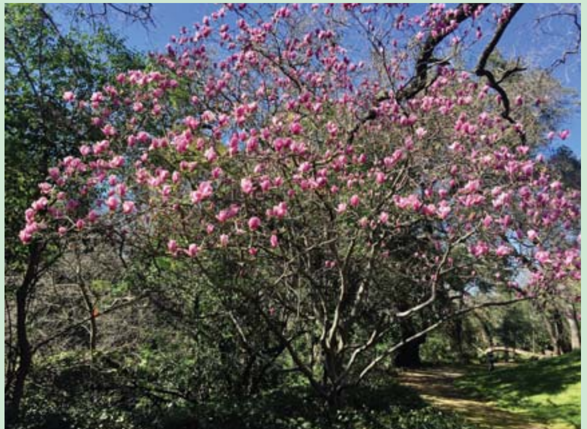
A spectacular tulip magnolia tree (Magnolia x soulangean) along a path.