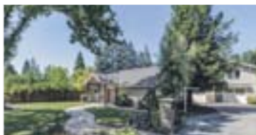
Danville Represented Seller