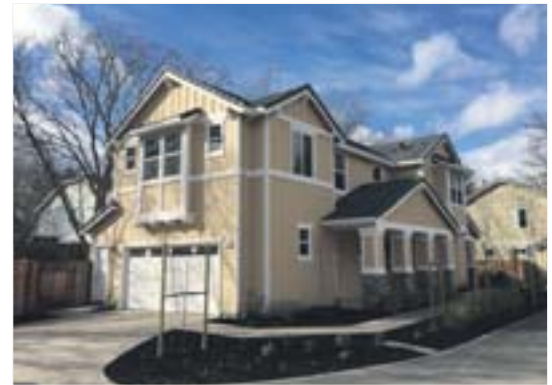
Pleasant Hill Represented Seller

YOUR KEY TO LAMORINDA™ & NEIGHBORING COMMUNITIES