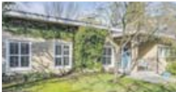
Lafayette Represented Seller