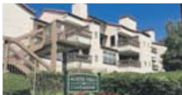
Walnut Creek Represented Seller