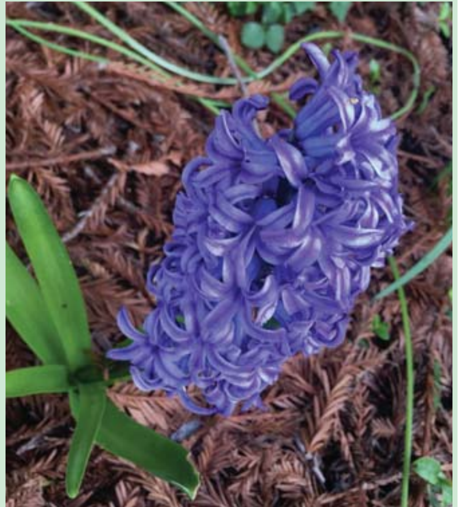
A shocking blue hyacinth pops up under the redwoods.

PRE-ORDER my forthcoming garden book, "Growing with the Goddess Gardener," Book I in the Garden Shorts Series. All pre-orders will receive extra goodies such as heirloom seeds, bookmarks and more. Email me for details, Cynthia@GoddessGardener.com . 25 percent of the proceeds benefit the 501c3 Be the Star You Are! charity. The book is expected to be available in April, just in time for spring planting.