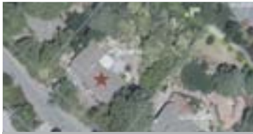
Orinda Represented Seller