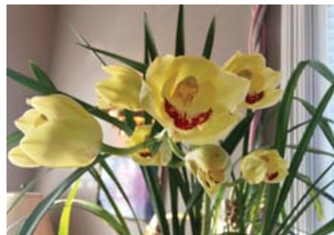
Yellow cymbidium orchid comes indoors.