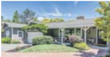
Lafayette Represented Seller