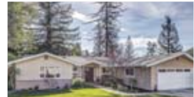
Moraga Represented Buyer