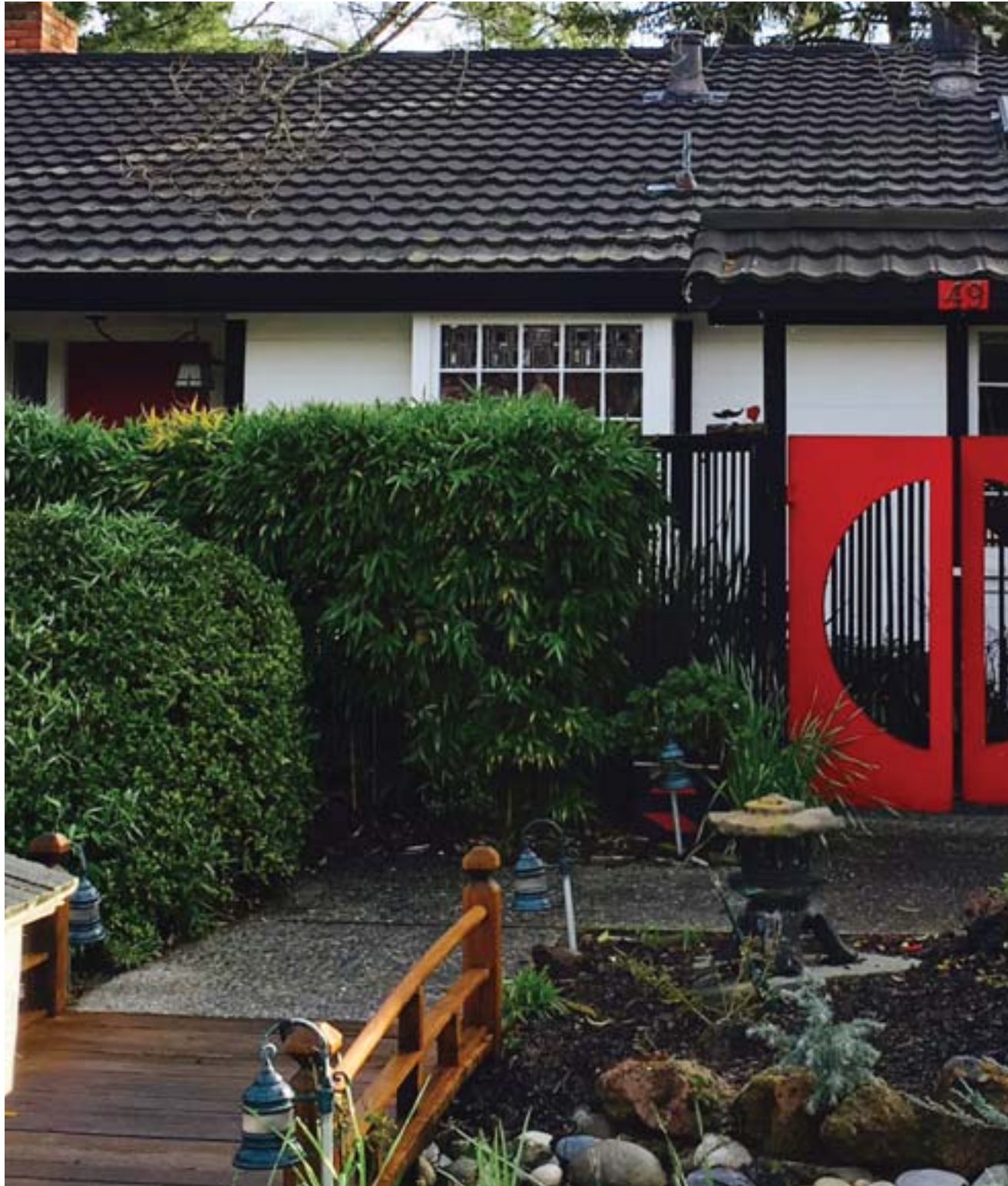
This Moraga residence has strong front entrance Feng Shui with lush greenery and chi-attracting and protective red front doors.

W hy is the home's front entrance so, well, front and center in Feng Shui?