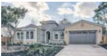
Walnut Creek Represented Seller