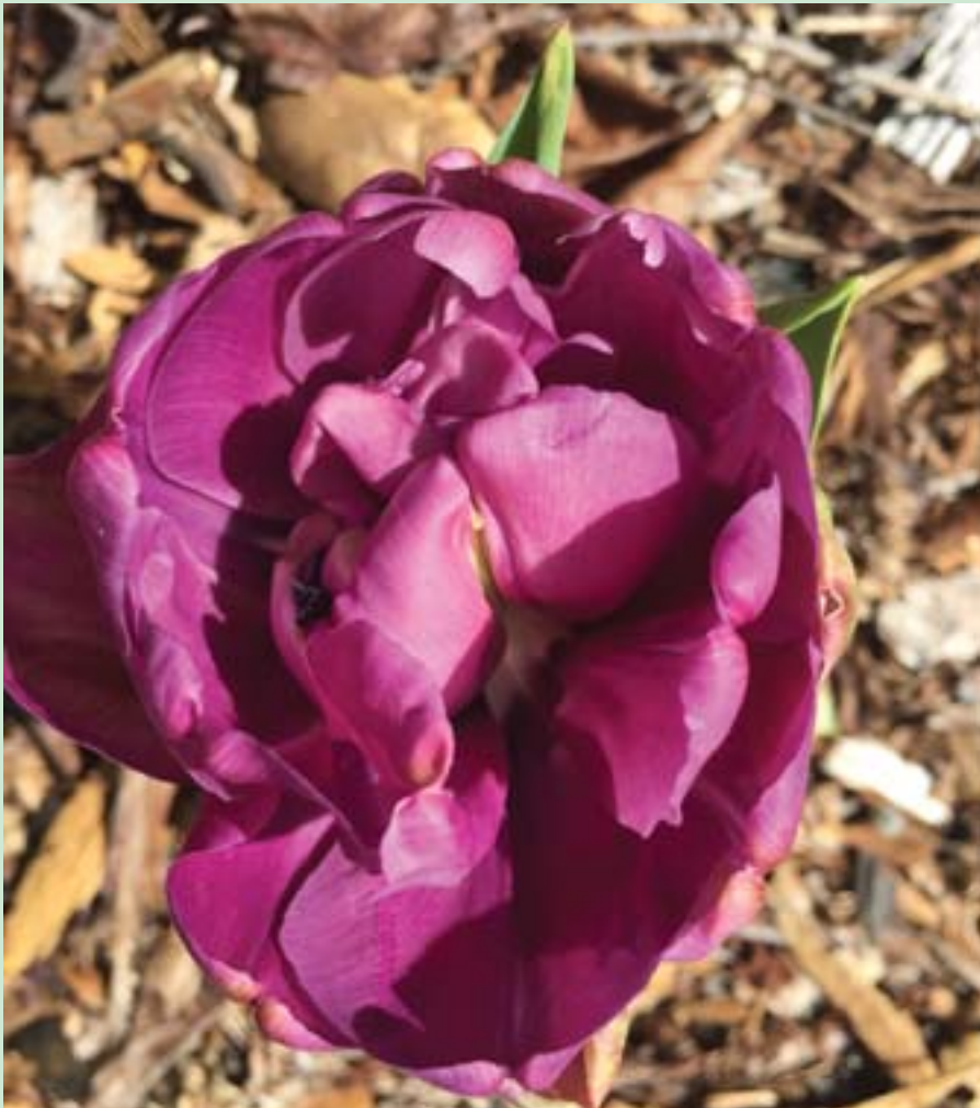
A close up of an unfolding magenta parrot tulip.

ASSIGN kids an area to grow their favorite vegetables. Research indicates that children who garden eat healthier. Tomatoes, peppers, zucchini, radishes, carrots and beans are all easy-to-grow.