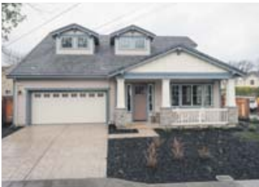
Pleasant Hill Represented Seller