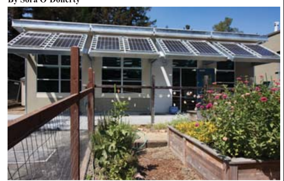
One of several environmentally-friendly Gen7 modular buildings placed on Orinda Union School District campuses this summer.

everal items were discussed at the Aug. 14 Orinda Union School District board of trustees meeting, including requests for restoration of advanced courses, board member assignments to specific schools and facility upgrades to Orinda campuses.