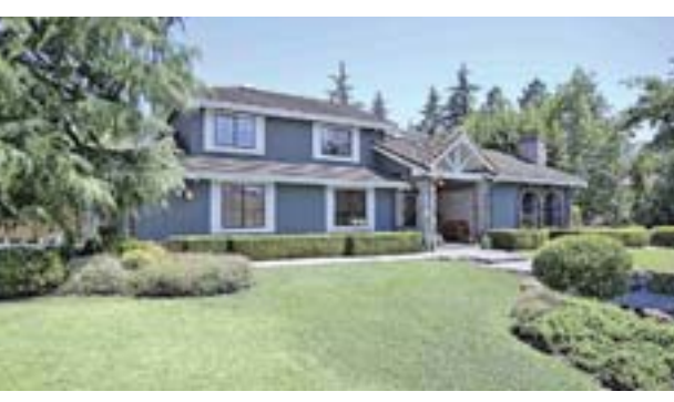
4 LAMP CT | MORAGA $1,695,000 5 BR | 2.5 BA | 3092 Sq. Ft. Elena Hood | CalBRE#01221247