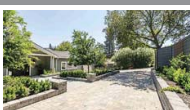
1106 UPPER HAPPY VALLEY RD | LAFAYETTE $2,195,000 4 BR | 3.5 BA | 2912 Sq. Ft. The Beaubelle Group | CalBRE#00678426