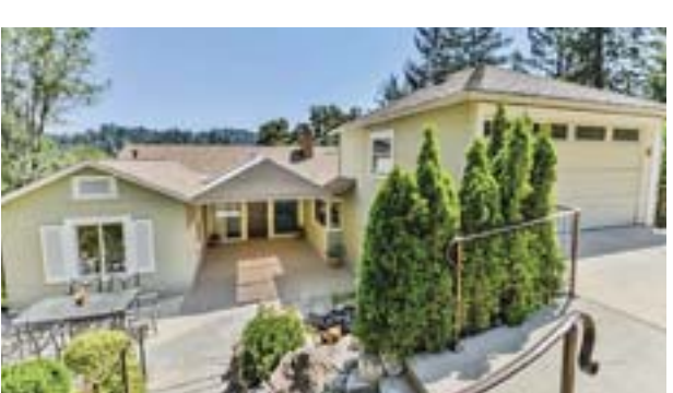
5 LOS CONEJOS | ORINDA $899,800 5 BR | 2 BA | 2263 Sq. Ft. Shellie Kirby | CalBRE#01251227