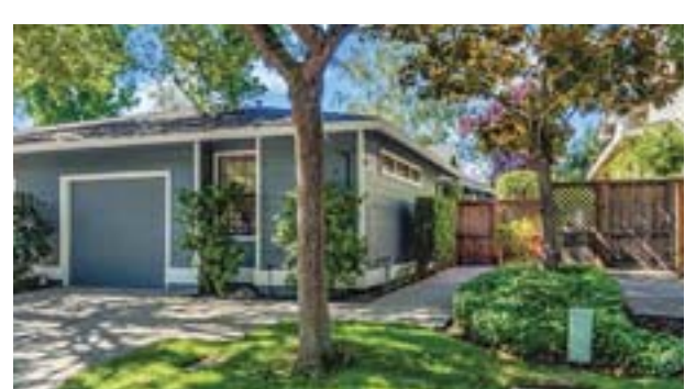
3 JOSEFA PL | MORAGA $735,000 2 BR | 2 BA | 1211 Sq. Ft. Michele McKay | CalBRE#01902466

5 Moraga Way | Orinda | 925.253.4600 | 2 Theatre Square, Suite 117 | Orinda | 925.253.6300