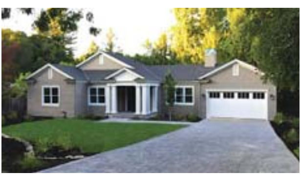
55 DONNA MARIA WAY | ORINDA $2,950,000 5 BR | 4.5 BA | 3907 Sq. Ft. The Beaubelle Group | CalBRE#00678426