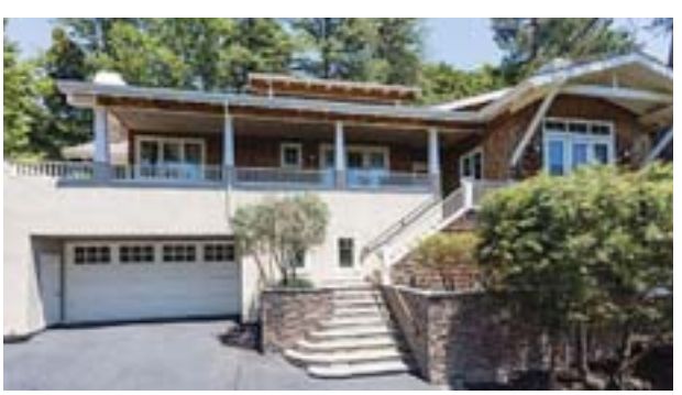
7 LA CINTILLA | ORINDA $2,795,000 4 BR | 4 BA | 4106 Sq. Ft. Melanie Snow | CalBRE#00878893