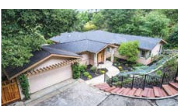
142 CANON DRIVE | ORINDA $1,650,000 4 BR | 3 BA | 2822 Sq. Ft. Shellie Kirby | CalBRE#01251227