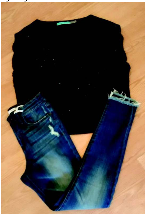
Fashion items available at Glamorous Boutique in Lafayette