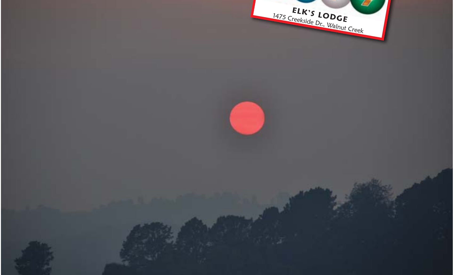
The evening sky over Lamorinda Oct. 12 filled with smoke from the North Bay wildfires.