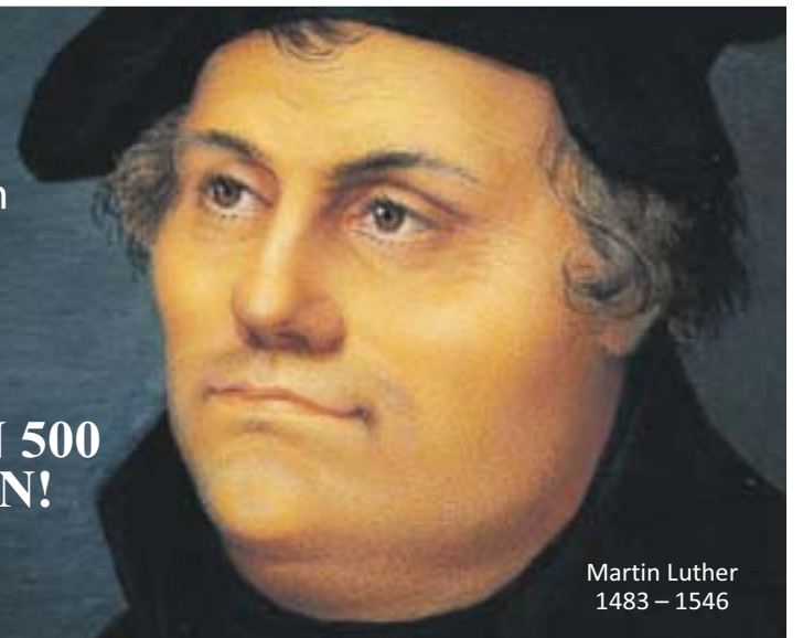
Martin Luther 1483 - 1546