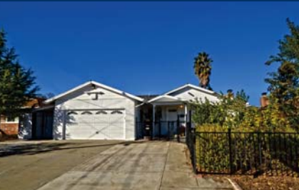
with Walnut Represented Seller