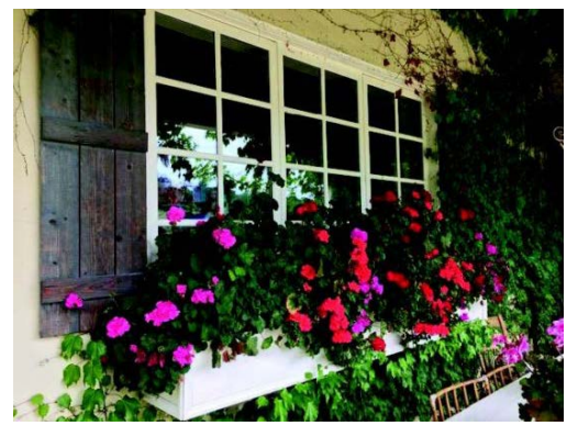
Geranium-filled window boxes Photos provided

The Lafayette Garden Club will host its Artful Gardens Tour over Mother's Day weekend on Saturday May 12, from 10 a.m. to 3 p.m. The self-guided tour will explore five magnificent Lamorinda gardens at the height of their spring glory, plus offer a pop-up market and plant sale.