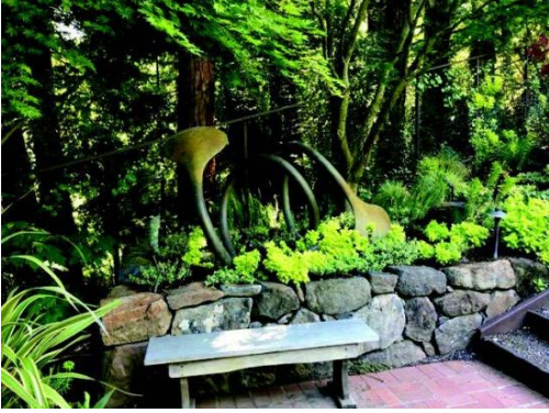
This sculpture finds its home in this shade garden