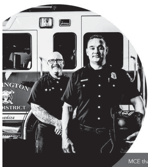
MCE thanks the Kensington Public Safety Building for protecting the environment and choosing Deep Green 100% renewable energy.

MCE es una agencia pública local, sin fines de lucro, que desde 2010 ha ofrecido servicios de energía renovable a tarifas bajas y estables a aproximadamente 450,000 clientes en el Área de la Bahía. PG&E continuará mandando su factura y proveyendo su energía con el mismo servicio confiable al que está acostumbrado, mientras que MCE comprará y desarrollará más fuentes renovables de energía solar, eólica, bioenergética, hidroeléctrica y geotérmica.