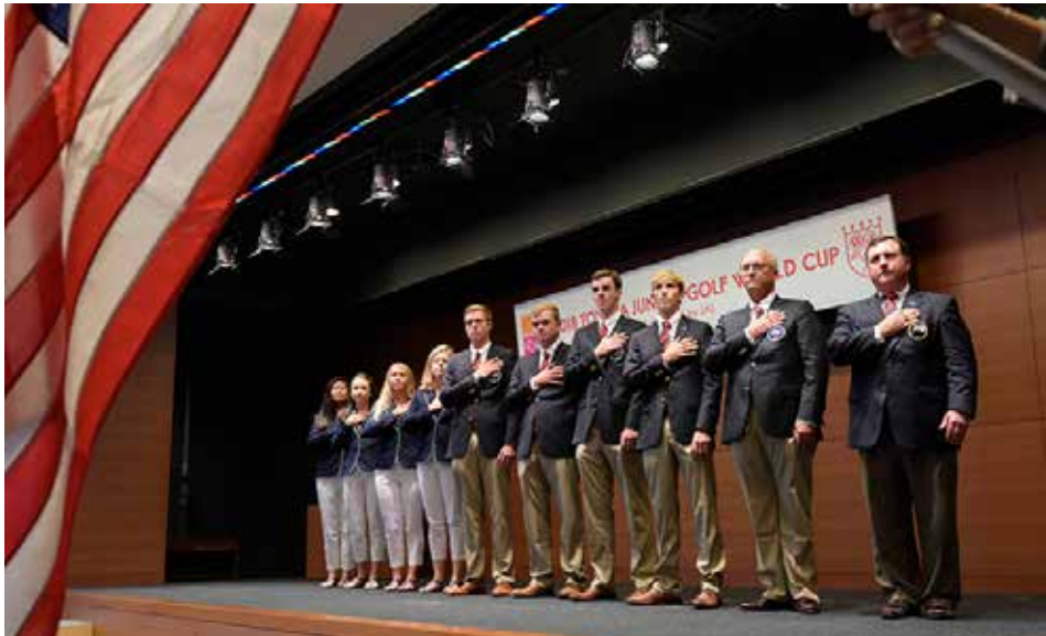
Team USA stands for the National Anthem as defending champions at the Opening Ceremonies of the Toyota Junior World Cup.