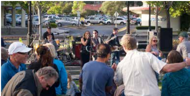
The Big Jangle perform on the Plaza on June 15.

What gets Lafayette dancing in June? Rock the Plaza concerts every Friday night in June, of course.