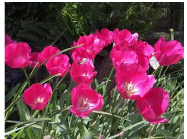
Traveling often involves stopping and smelling the flowers. Placing a photo like these colorful poppies enjoyed on a trip to Big Sur recently can help activate the Travel, Helpful People and Heaven Bagua area.

The Travel, Helpful People and Heaven area of the feng shui Bagua is located along the front entrance door wall, on the near wall as you look into the space. This is often overlooked area, which is relevant for a healthy life area of the Bagua map, is governed by the metal element, which can be activated with colors like white, silver, grey and metallic, or inspirational, helpful or grateful sculptures made of bronze, like of Ghandi, Buddha or Arch Angel Michael. Place a photo gallery of your family or friends who are also helpful to you in this area, but avoid placing any reminders of people here who made your life difficult. Place symbols of who and what you feel gives you a sense of deep gratitude. ... continued on page D10