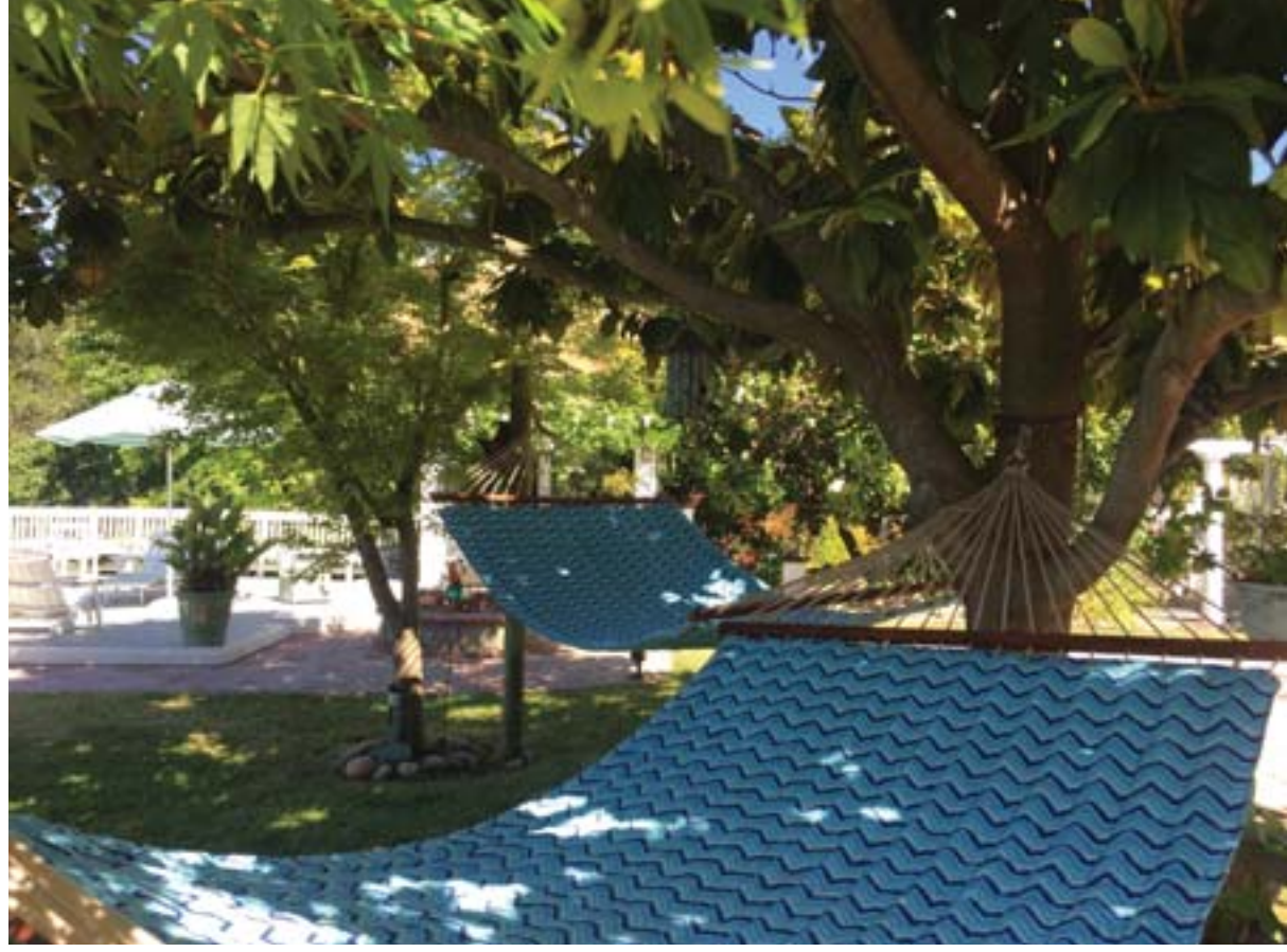
A double hammock doubles the summer relaxation.

Other popular home remedies include application of toothpaste, a wet tea bag, Preparation H, or a slice of onion. Be aware that it may take a week or longer for the pain, swelling, and itching to subside. Again, if in doubt about the severity of the sting, contact your physician.