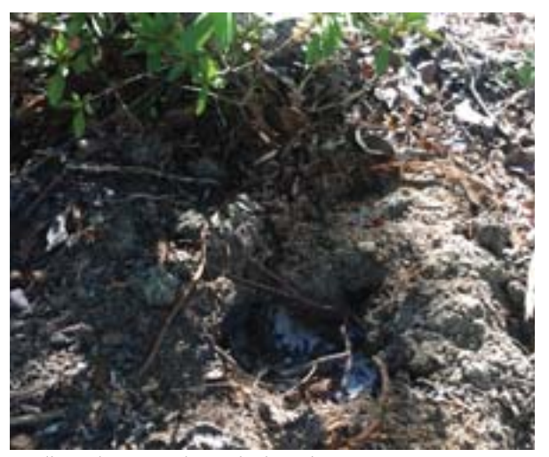
A yellow jacket nest in a burrow by the azalea.

7. Apply hydrocortisone cream to reduce swelling and itching. ... continued on page D15