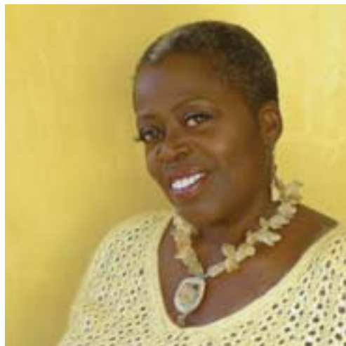
Lillias White

Tony and Emmy award winner Lillias White will kick off opening night of the Live at Orinda Concert Series at 7:30 p.m. Sunday, Aug. 12 as the Orinda Theatre is once again transformed into a cabaret.