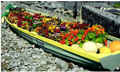
At Doolin pier in West Ireland, a boat of orange, yellow, and red greets visitors.