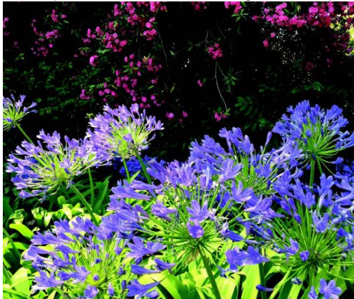
A field of blue agapanthus fronts pink oleanders.