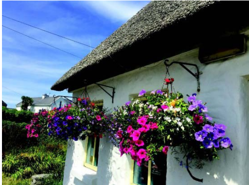
On a thatched cottage in the Aran Islands hang gorgeous baskets of blooms.