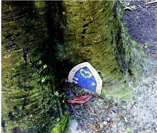
In Galway, a tiny door leads to a house for leprechauns.