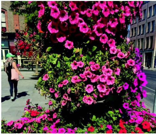
A tower of flowers.