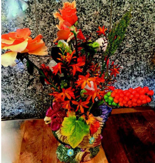
A birthday creation in a rooster teapot.