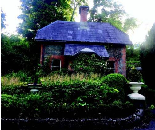
A small guest house flanked with ivy and astilbe.