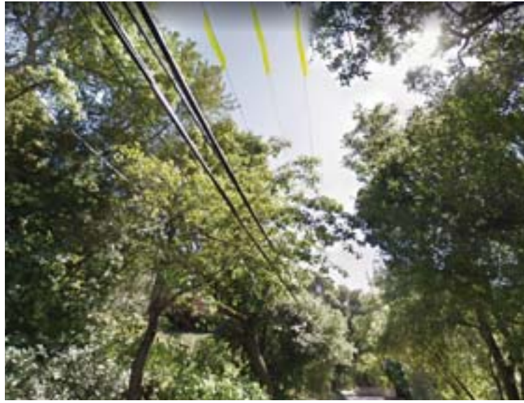
PG&E electrical lines along Miner Road are highlighted in yellow.

To outline a vegetation removal project along Miner Road, the city of Orinda held a July 26 neighborhood meeting that included representatives from Pacific Gas and Electric Co., the city and the Moraga-Orinda Fire District. PG&E and the city explained that 110 trees needed either pruning or removal along the road in order to maintain a safe distance from electrical power lines and to provide adequate clearance for emergency vehicles.