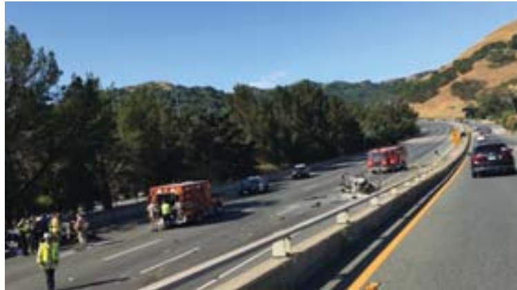
The reason for the major congestion

A single vehicle accident on Highway 24 near the Orinda BART station on July 21 caused a traffic standstill on the westbound freeway, with local residents complaining about two-hour delays to drive between Pleasant Hill and Orinda, gridlock on downtown Lafayette streets and no traffic control on either the highway or the on-off ramps in each community.