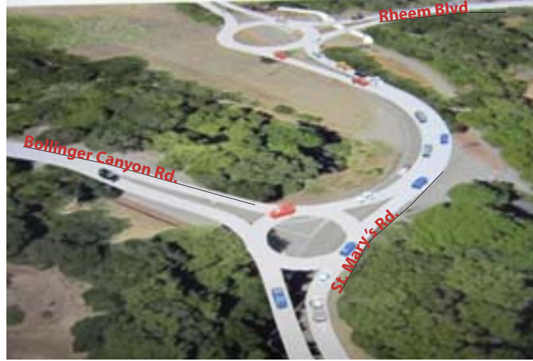
Simulation of the two roundabouts as presented at the recent meeting.

Town representatives and project team members invited the public to attend another community informational meeting Sept. 27 at Saint Mary's College to hear updates regarding the St. Mary's Road and Rheem Boulevard/Bollinger Canyon Road roundabouts. The public was given a choice to attend a 4:30 p.m. or 6:30 p.m. presentation, both of which covered the same information.