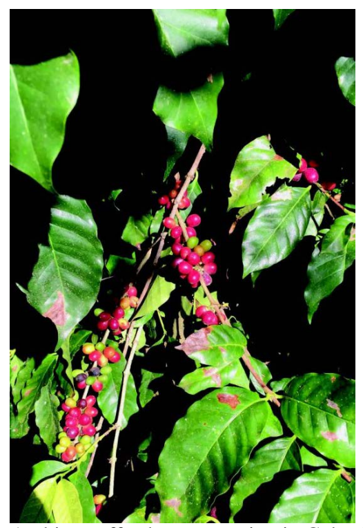
Arabian coffee beans growing in Cuba.