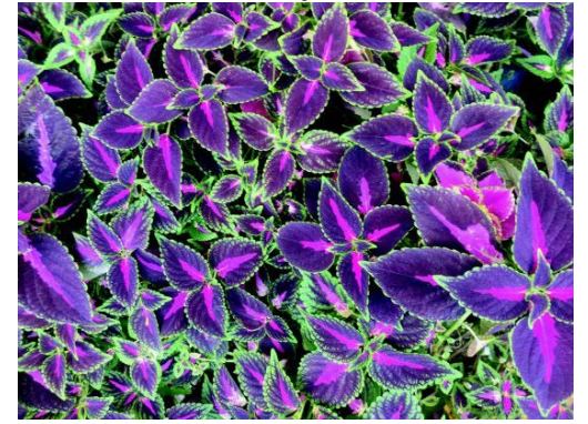
A happy coleus is bright and pink.