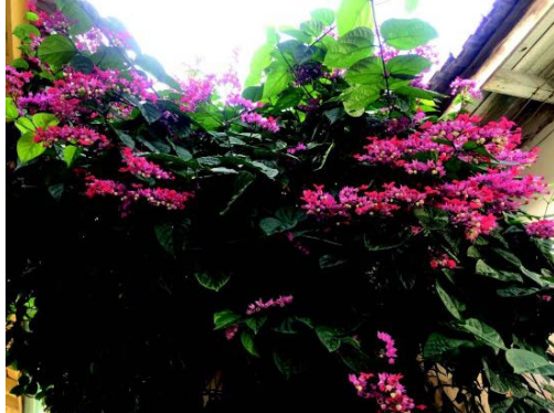
The gloryblower vine in bloom in Cienfuegos, Cuba.