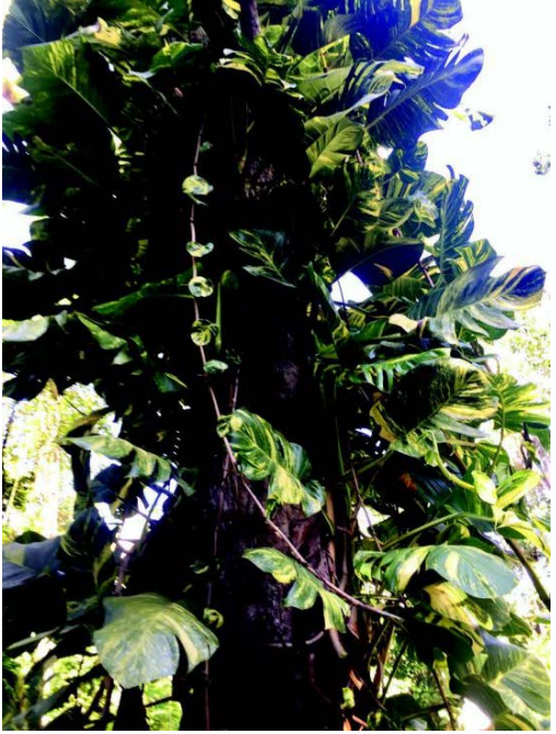
A philodendron climbs a tree in the Cuban forest.