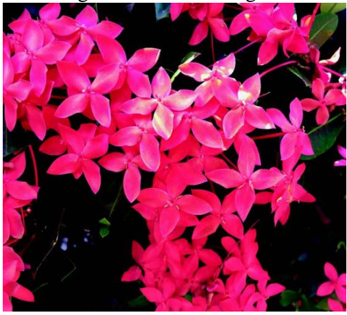
Ixora, scarlet jungle flame grows throughout the rain forests.