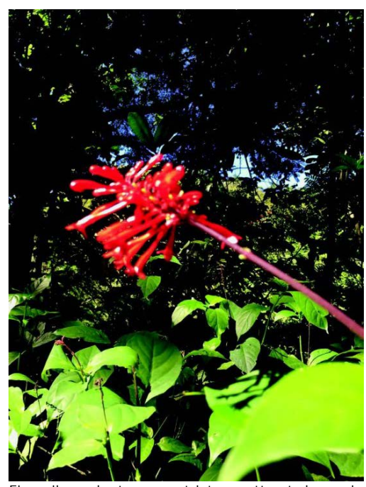
\label{lem:problem} \mbox{Firespike, odontonema strictum, attracts humming birds and beneficial insects.}