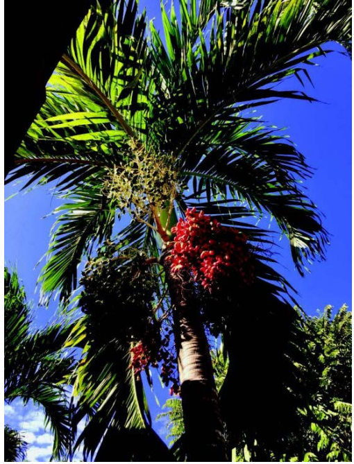
The fruit of the Cuban Royal Palm is a favorite of birds.