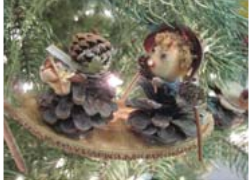
Two critters in a boat