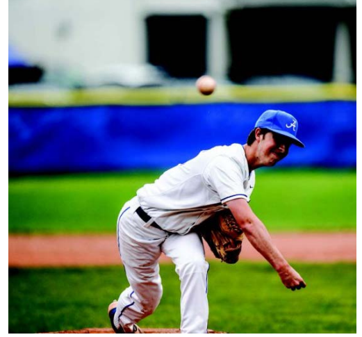
Eddie Burns

Published May 29, 2019 Acalanes closes season with second round loss to Heritage By Jon Kingdon