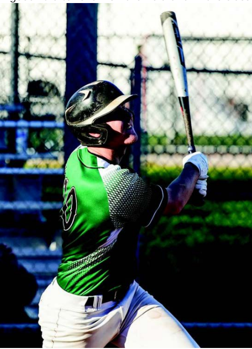
Joe Hollerbach

A good rule to follow on the field and in the classroom.