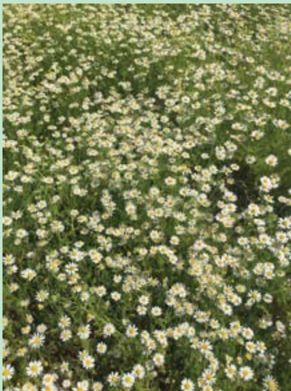
A field of charming and restorative chamomile.